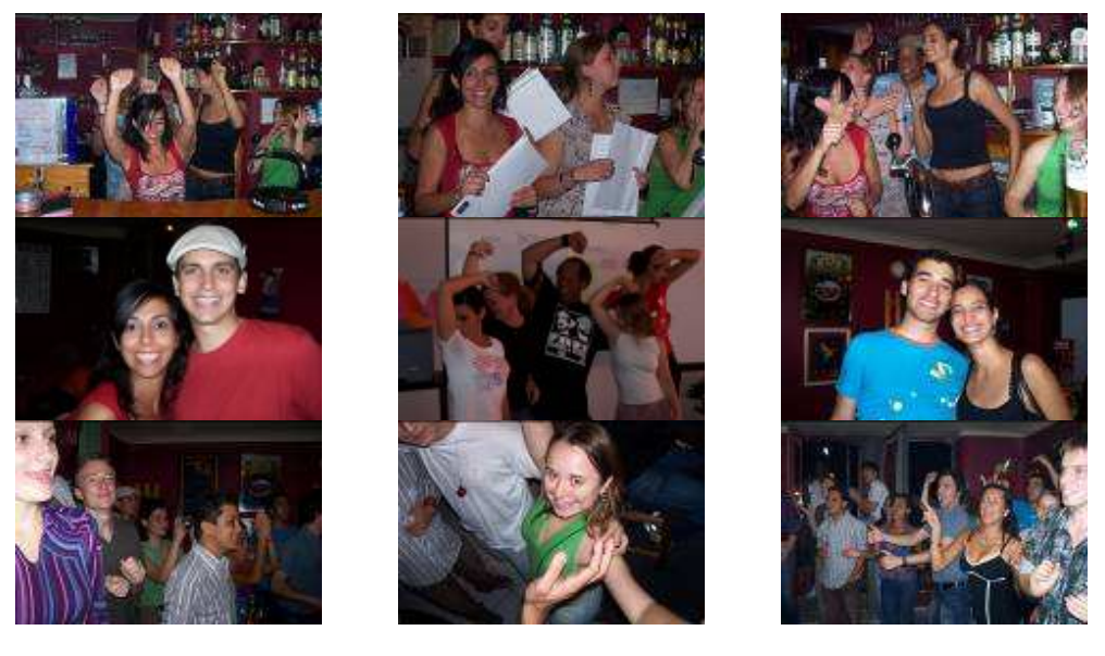
Day 7 (Sunday, July 15h)- Departure

everyone by name by then and hence overtaking the counter was no problem. So the members of the preparation team went behind it and everyone said some closing words regarding the study session. We then started distributed the certificates with attaching 1-2 sentences, comments, memories from the week before telling the actual name. The rest would always guess the name and shout in a choir. We ended with a common dance and the informal party started with intensive sessions on emotion-confessions, promises to meet next year, many pictures and endless laughter.