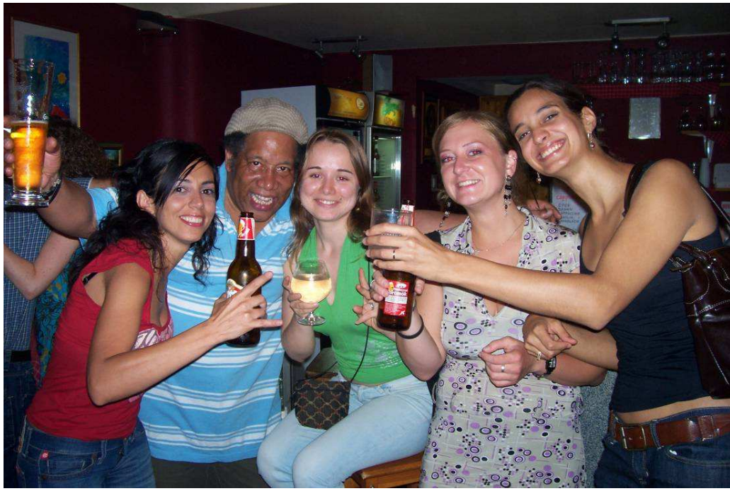
- Ask participants to bring some national food and music;