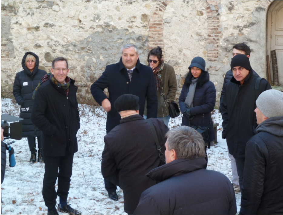
Figure 3 Governor of Dusheti explains the context of the heritage site

Session 3 focused on Strategic action points for the consolidation phase. The ten action points are based on those actions that had been listed as important the previous afternoon. These are presented in the table below for all nine towns. Each town was asked to respond to each of the ten steps that were seen as important to secure funding.