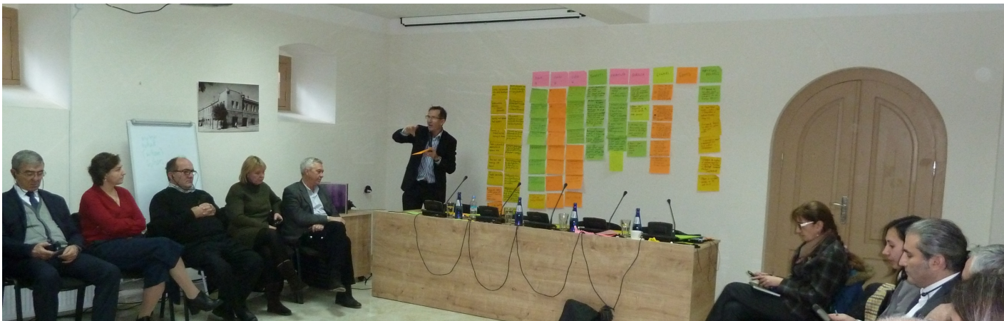
Figure 4: Discussions around follow-up actions in final session.

Session 3 focused on Strategic action points for the consolidation phase. The ten action points are based on those actions that had been listed as important the previous afternoon. These are presented in the table below for all nine towns. Each town was asked to respond to each of the ten steps that were seen as important to secure funding.