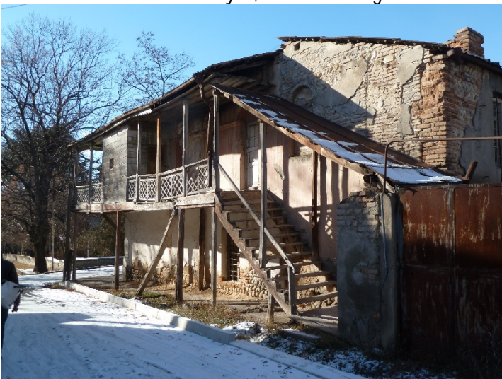
Figure 2: Heritage building in Dusheti

At the invitation of the Mayor, a visit was organized to Dusheti.