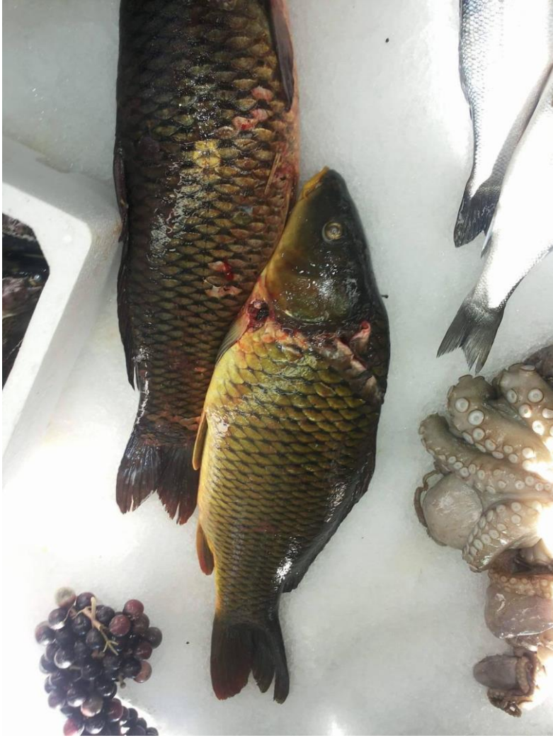
Allegedly farmed carp sold during the fishing ban in the supermarket