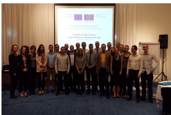
Training on liability of legal persons, 17-18 September 2014, Tbilisi, Georgia