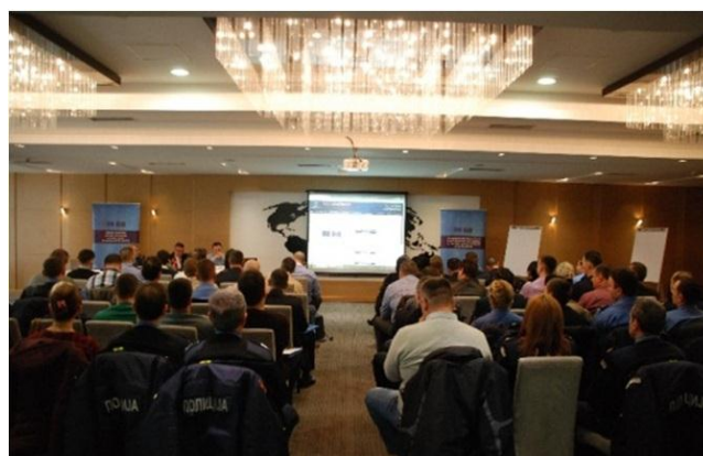
Presentation of CEPOL Curriculum on Police Ethics and Integrity, 17 December 2014, Belgrade, Serbia.

The “Project against Money Laundering and Terrorist Financing in Serbia” (MOLI) was finalised in May 2014. It assisted the Serbian authorities in drafting the National AML/CFT Strategy and Action Plan for 2015-2018 , which was adopted by the government at the end of 2014. Furthermore, a comprehensive National Risk Assessment in the area of terrorist financing was carried out. The Project mainly supported the on-going legislative processes in amending and improving key laws and regulations, and in particular the Serbian AML/CFT Law.