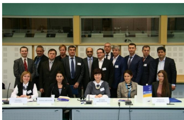
Regional Business Ombudsmen and PRECOP RF staff during a Study Visit to the Council of Europe, 14 November 2014, Strasbourg, France.

Still in Russia, for the 4th year, a specialised training on Basic Anti-corruption Concepts took place twice under a Council of Europe training programme. The one full-week certified course involved a total of 160 civil servants, judges and prosecutors from different regions of the country. A Manual for Practitioners was further developed with inputs from Russian specialists and published for use in continuous vocational training.