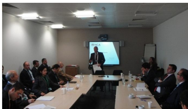
International Training at the UK National Crime Agency on Modern Techniques for Corruption Investigation, 10-14 November 2014, London, UK