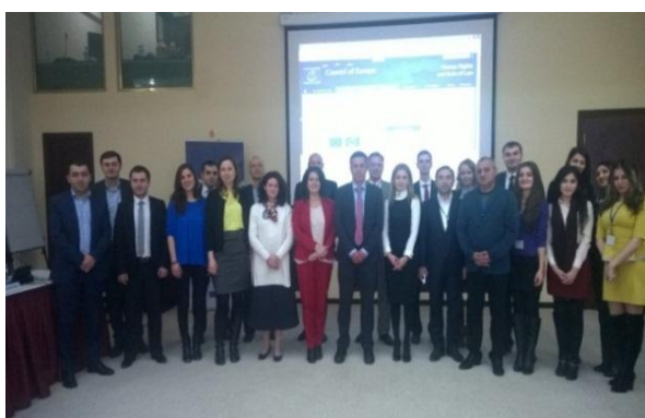
EaP Project Closing Conference, 12 December 2014, Tbilisi, Georgia.