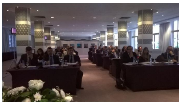
Training on administrative inquiries technics, 16-17 October 2014, Rabat, Morocco.