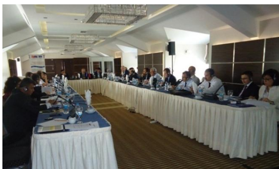
Workshop to review the draft Investigation Guide, 19 June, 2014, Ankara, Turkey

The other EU/CoE JP project in Turkey on “Strengthening the Coordination of Anti-Corruption Policies and Practices” (TYSAP) elaborated an Investigation Guide for Inspectors where Turkish and International experts worked together in setting uniform standards for conducting administrative investigations, their relevant reporting and coordination by inspection bodies. The Guide will be used as a basis for other deliverable[s] such as a manual for training of inspectors. Furthermore, 44 Turkish administration inspectors were trained at the UK’s National Crime Agency (NCA) and at the European Union Anti-Fraud Office (OLAF) on corruption and fraud investigation modern techniques.