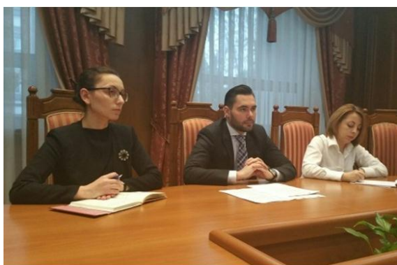
Scoping mission to Chişinău, meeting at the MFA with participation of Mr. Iulian Groza, Deputy Minister, 19-20 November, Chisinau, Moldova

Scoping missions took place in four out of the six countries of the Eastern Partnership region: Azerbaijan, Georgia, Moldova and Ukraine - aimed at assessing needs for technical assistance and cooperation projects on anti-corruption, economic crime and money laundering issues. As a result, four project proposals were developed during 2014 and are expected to be implemented under the CoE/EU Eastern Partnership Programmatic Co-operation Framework (PCF).