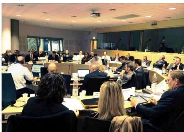
PECK assessment team meeting Kosovo authorities to discuss draft Final Assessment Reports, 3-4 November 2014, Strasbourg, France.