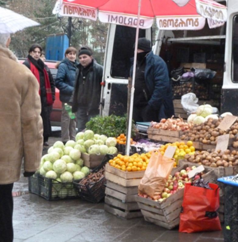
CHIATURA ► Market Place

■ The Council of Europe/European Union joint project “Community-Led Urban Strategies in Historic Towns” (COMUS) has been carefully designed to introduce innovative approaches that use urban rehabilitation as a means of contributing to wider objectives, such as the celebration of diversity, the development of constructive dialogue and the promotion of mutual respect between people of different cultures and religions, greater well-being and better quality of life.