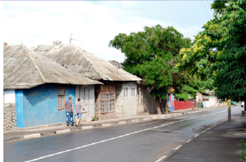
SOROCA ► Old urban houses on Decebal Street

COMUS focuses particularly on the active engagement of society at all levels: community-based engagement through the Project Implementation Unit and Local Stakeholders Group, as well as municipalities and central level engagement through the National Stakeholders Group.