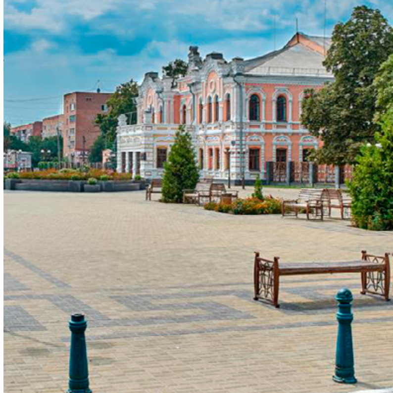
PRYLUKY ► Theatre Square, the popular cultural heart of the town

■ The Council of Europe/European Union joint project “Community-Led Urban Strategies in Historic Towns” (COMUS) has been carefully designed to introduce innovative approaches that use urban rehabilitation as a means of contributing to wider objectives, such as the celebration of diversity, the development of constructive dialogue and the promotion of mutual respect between people of different cultures and religions, greater well-being and better quality of life.