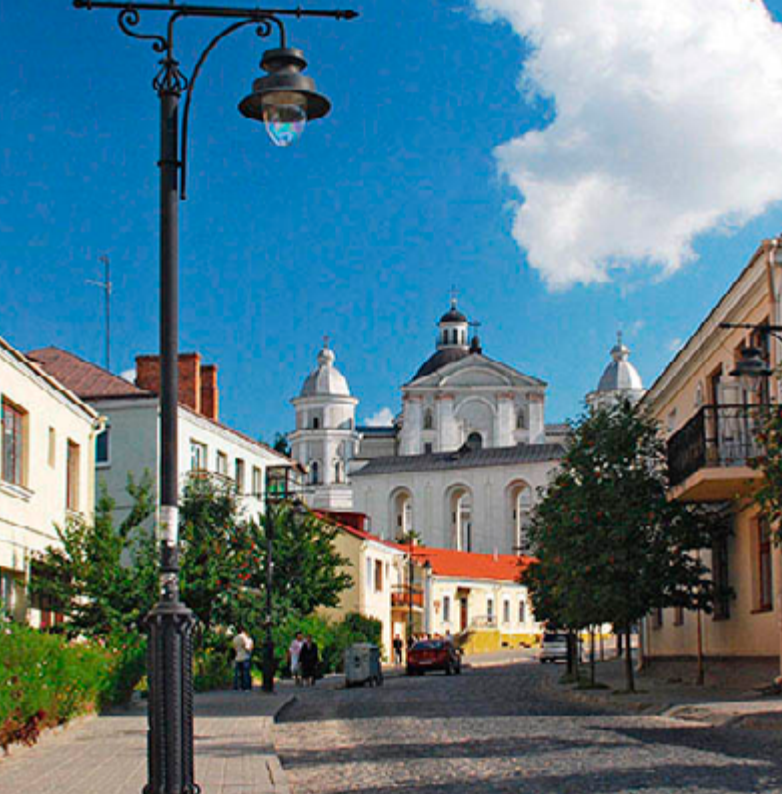
LUTSK ► Old town