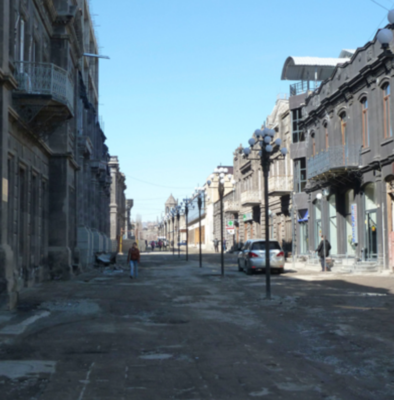
GYUMRI ► Abovyan Street, one of the historic pedestrianised streets in Gyumri