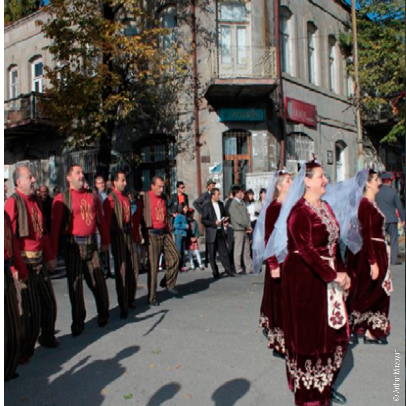
GORIS ► Traditional Dance Ensemble in the historic centre

■ The nine participating pilot towns are seeking specific responses to a number of issues related to sustainable local development, including: