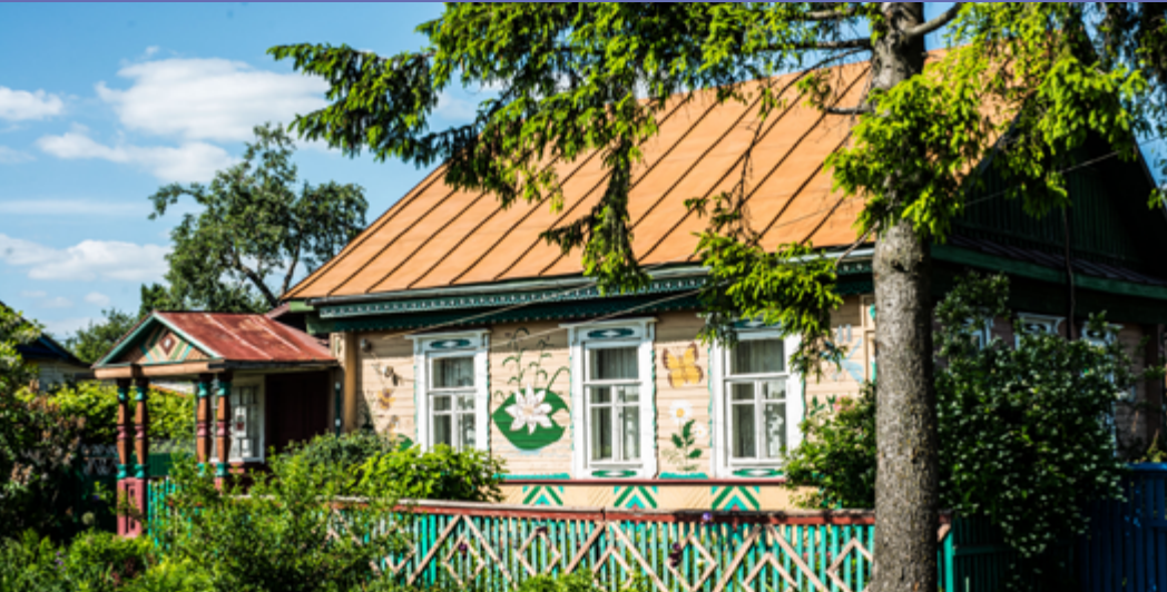
MSTISLAV ► Traditional town house