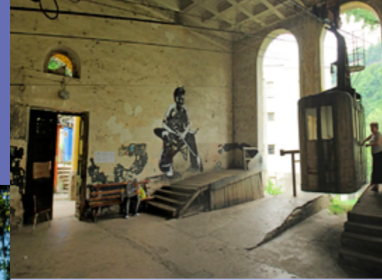
CHIATURA ► Oldest preserved public cable car station, built in 1953, with murals added in 2015