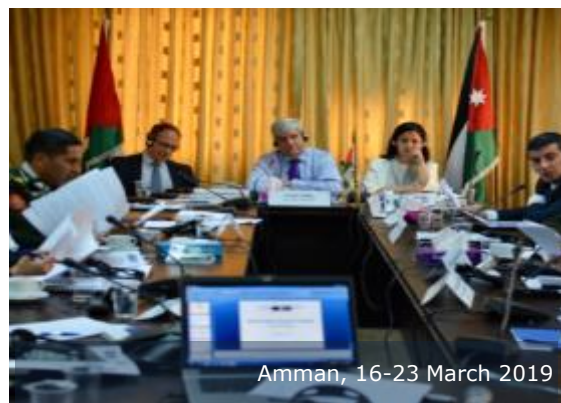
Amman, 16-23 March 2019