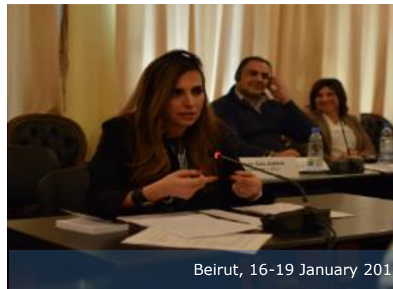
Beirut, 16-19 January 2019