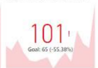
Judges Time per Case (minutes)