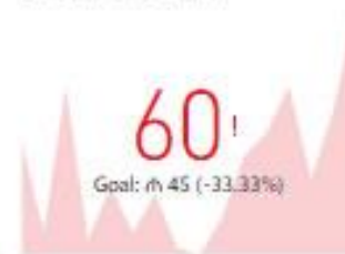
Cost per Case (AZN)