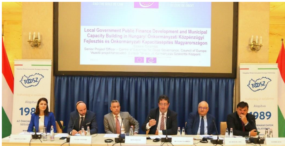
Launching Conference of the project in Budapest

A new project " Local Government Public Finance Development and Municipal Capacity Building In Hungary ", co-funded by the Council of Europe and the European Union, was launched in September 2022. It was developed in close cooperation with the main beneficiary, the Hungarian National Association of Local Authorities (TÖOSZ), and aims to strengthen the administrative and financial capacity of the municipalities in Hungary.