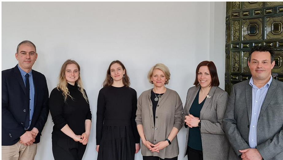
ELoGE - training of trainers

In early 2022, the ELoGE process was launched by the accredited Latvian institution, Providus, as a means of measuring good governance standards of Latvian local authorities against the 12 Principles of Good Democratic Governance. Providus has committed to promoting the 12 Principles of good democratic governance across the country and raising awareness of the need for continuous improvement of the work of the municipalities. Rolling out ELoGE, which also serves as a diagnostic tool in respect of good governance practices, has helped identify additional needs towards strengthening the Latvian multi-governance system. As a result, the national authorities have already expressed their wish to develop a more significant project to be implemented by the CEGG as of 2023.