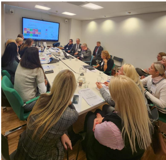
Study visit in Finland

Capacity-building support was also delivered to Lithuanian regional authorities to empower them to improve good democratic governance at the regional level, A series of training workshops on relevant topics, and a study visit to Helsinki were organised to develop capacities of Lithuanian participants and share learning between member States. Topics addressed in the study visit included coordination of the different bodies at the regional level, the politically accountable regional structures as well as on the ambitious plans for reforms to regional governance in the host country.