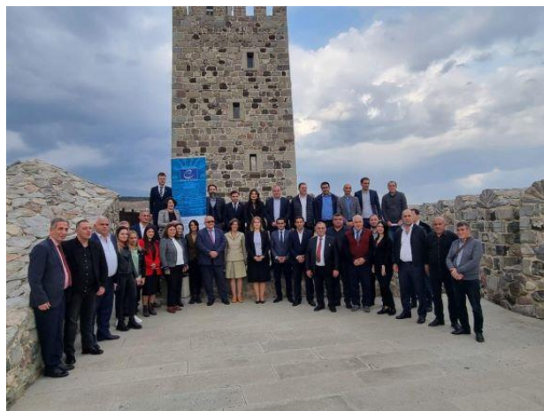
Leadership for Cross-border Cooperation, Stage 2, Georgia

Following the launch of the Leadership Academy Programme for Cross-border cooperation in Armenia in May 2022, the 2 nd Stage of the LAP for CBC was held in Akhaltsike, Georgia 17-19 October 2022. Participants examined the legal framework for cross-border cooperation and identified potential ratification of Protocol No. 3 to the Madrid Outline Convention on Cross-border cooperation as a possible solution to launching cross-border cooperation arrangements.