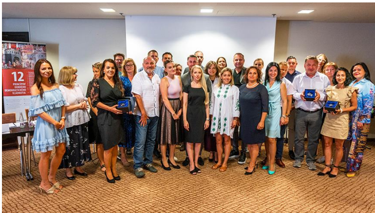
2 nd round of ELoGE in Slovakia – Awards ceremony

The comprehensive package of concrete recommendations should help the Slovak government make a well-informed decision on the pending reform related to the national multi-level governance system, in line with Council of Europe standards on good democratic governance and the most relevant European practice. In addition to the policy recommendations, CEGG has simultaneously implemented different capacity-building tools for the local authorities, in cooperation with several local partner organisations. The tools touch upon areas such as: Strategic Municipal Planning , Public Ethics Benchmarking , Local Finance Benchmarking , preparation of different national training programmes and implementation of the second round of ELoGE in the country.