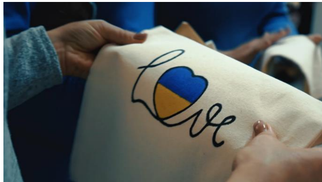
Horodok community, Khmelnytskyi region)

Irrespective of the permanently changing and volatile context, CEGG thus remained the main advisor to the Government and the Parliament of Ukraine on promoting respect for good democratic governance.