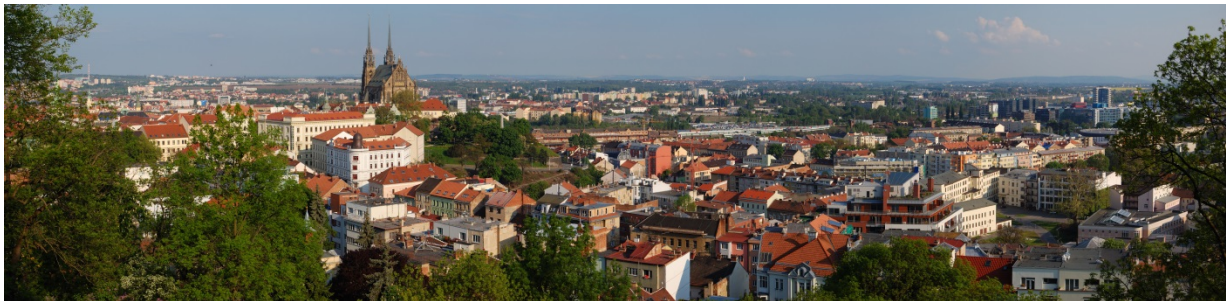
Brno view, by Petr Šmerkl

Photo 3 - https://cs.wikipedia.org/wiki/Soubor:K%C5%99tiny-kostel2013zo.jpg