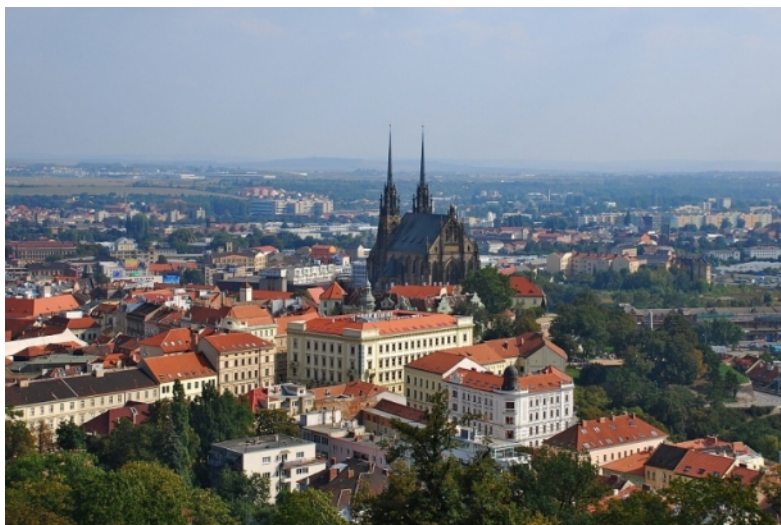
Brno view, by Norbert Aepli

Document prepared by the Directorate of Democratic Governance Secretariat of the European Landscape Convention, Council of Europe