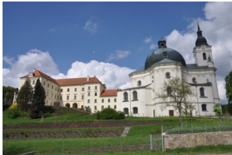
Křtiny Castel: Ben Skála

The return to Brno will be around 23.30.