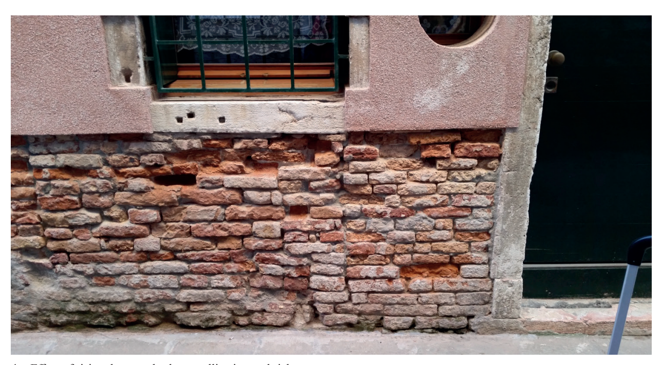
4. - Effect of rising damp and salt crystallization on brick masonry. Effet des remontées capillaires et des cristallisations salines sur une maçonnerie en briques.

General short (by 2020) and long (over 2020) term "soft" recommendations are also given aiming at increasing the awareness on impacts, vulnerability and adaptation measures: