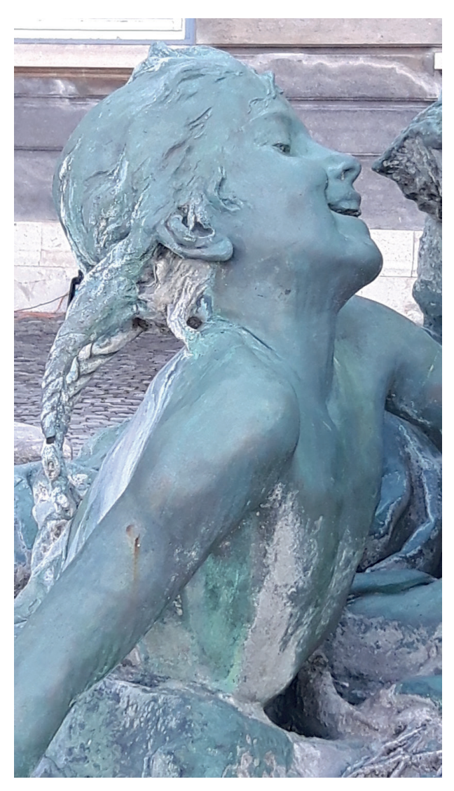
2. - Undesired corrosion on bronze due to the synergic effect of temperature, relative humidity and deposition of SO<sub>2</sub> and particulate matter.

This identification derives mainly from the results achieved within EU FP6 Project "Global climate change impact on built heritage and cultural landscapes - Noah's Ark" (2004-2007) (Brimblecombe et al. , 2006, Sabbioni et al. , 2010). This project coordinated by CNR-ISAC had for the first time produced a Vulnerability Atlas and Guidelines for Cultural Heritage protection towards climate change. The Noah's Ark coupled climatology with conservation science expertise, acquired a unique know-how in delivering future forecast of Cultural Heritage vulnerabilities induced by outdoor-indoor climate