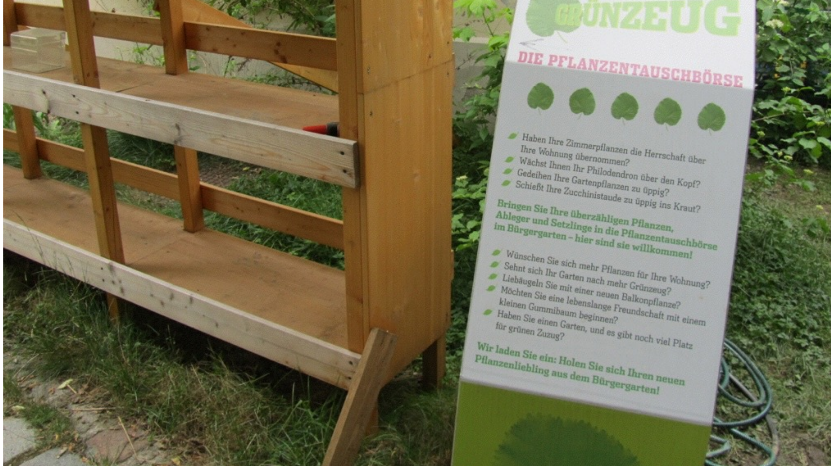
Guerrilla Gardening performance in Vienna: plant-sharing-shelf