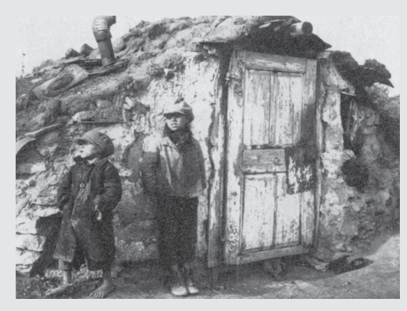
III. 2 (from Mayerhofer 1988, p. 177)