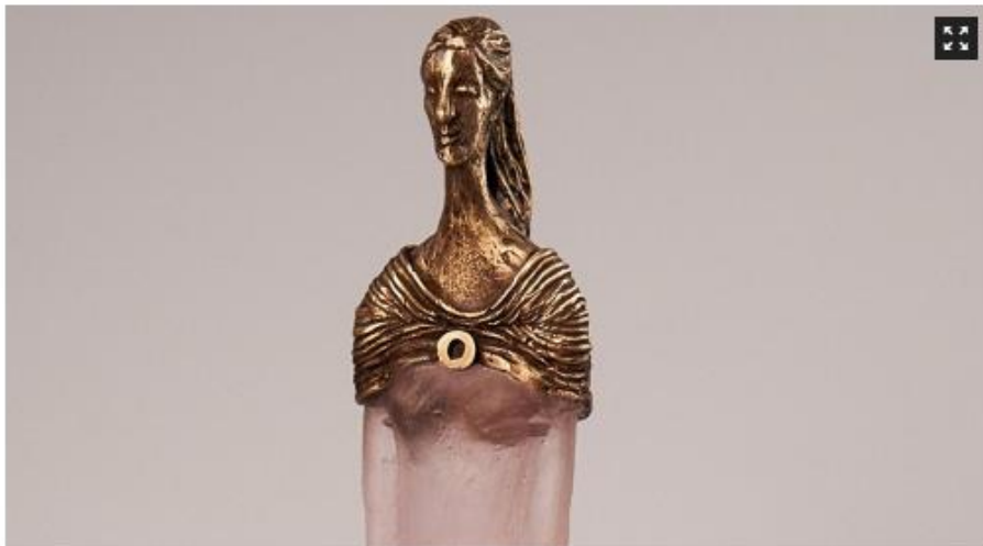
Unterstützt Regisseurinnen: Der Eurimages Audentia Award

Der Eurimages Audentia Award wird dieses Jahr im Rahmen des Toronto International Film Festival vergeben. Der Preis, mit 30.000 Euro dotiert, zeichnet die beste Leistung einer Regisseurin aus. Die Verleihung wurde zum ersten Mal 2016 beim Istanbul International Film Festival vergeben, vergangenes Jahr dann beim Locarno Festival.