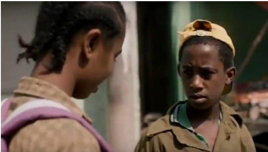
"תאנה עץ" מתוך

חברת ידי על להפצה השבוע נרכש מוברמן אורן שהפיק הסרט. גזעניים בקעקועים המעוטר מעורו וכן, מלבו השנאה 2020 האוסקר בטקס השחקן לפרס אפשרי כמועמד בל את מסמנים כבר האמריקנית ובתקשורת, המוערכת A24 (2019 במאי לאקרנים ייצא הסרט, זו שעה לפי).