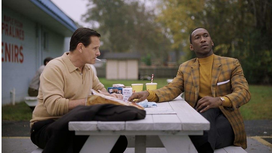
מתוך הסרט kooB neerG

מטעם פרסים שיחלק שופטים צוות ממינוי נמנעים בטורונטו, בעולם המובילים הקולנוע פסטיבלי לרוב בניגוד היחידי ולמעשה הגדול הפרס שהוא, הקהל חביב פרס על בהצבעה שישתתפו כדי לצופים פונים ופשוט המארגנים Green ב-שראו, מהמבקרים רבים לדעת גם וקלע, דברו את אמר והקהל. הפסטיבל מטעם רשמי באופן שמוענק אחיו עם פרעות קומדיות על מעבודותיו בעיקר המוכר האמריקני הבמאי. ביותר הטוב כסרט פארלי פיטר של Green Book מתגבשת ובמהלכו ה-60 שנות של הברית בארצות ומקסים משעשע, מרגש מסע סרט למסך הביא, פארלי בובי ויגו) איטלקי ממוצא לבריון (עלי מאהרשאללה של בגילומו) שירלי דון אמריקני-האפרו הפסנתרן בין אמת חברות הברית ארצות של הגזעני בדרום שלו ההופעות סיבוב במהלך במכוניתו לנהוג כדי שנשכר (מורטנסן