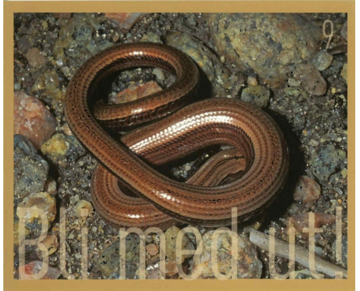
Norske amfibier og reptiler (Feltherpetologisk guide)