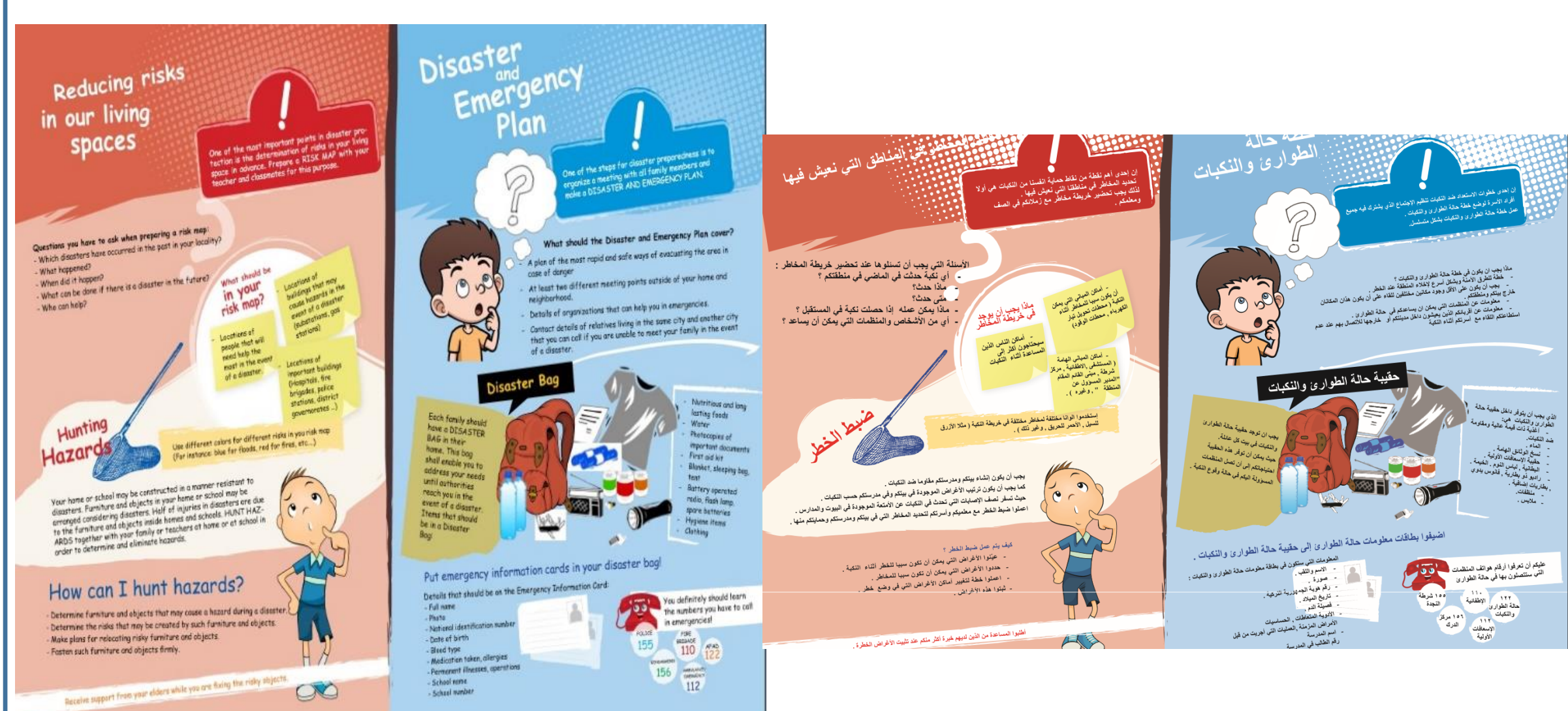
Figure. Brochures for children