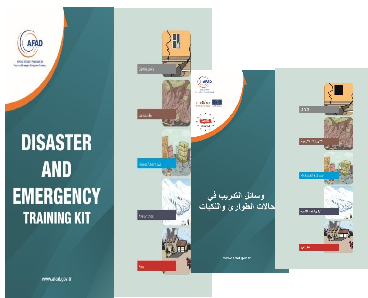
Figure. Training kit for adults