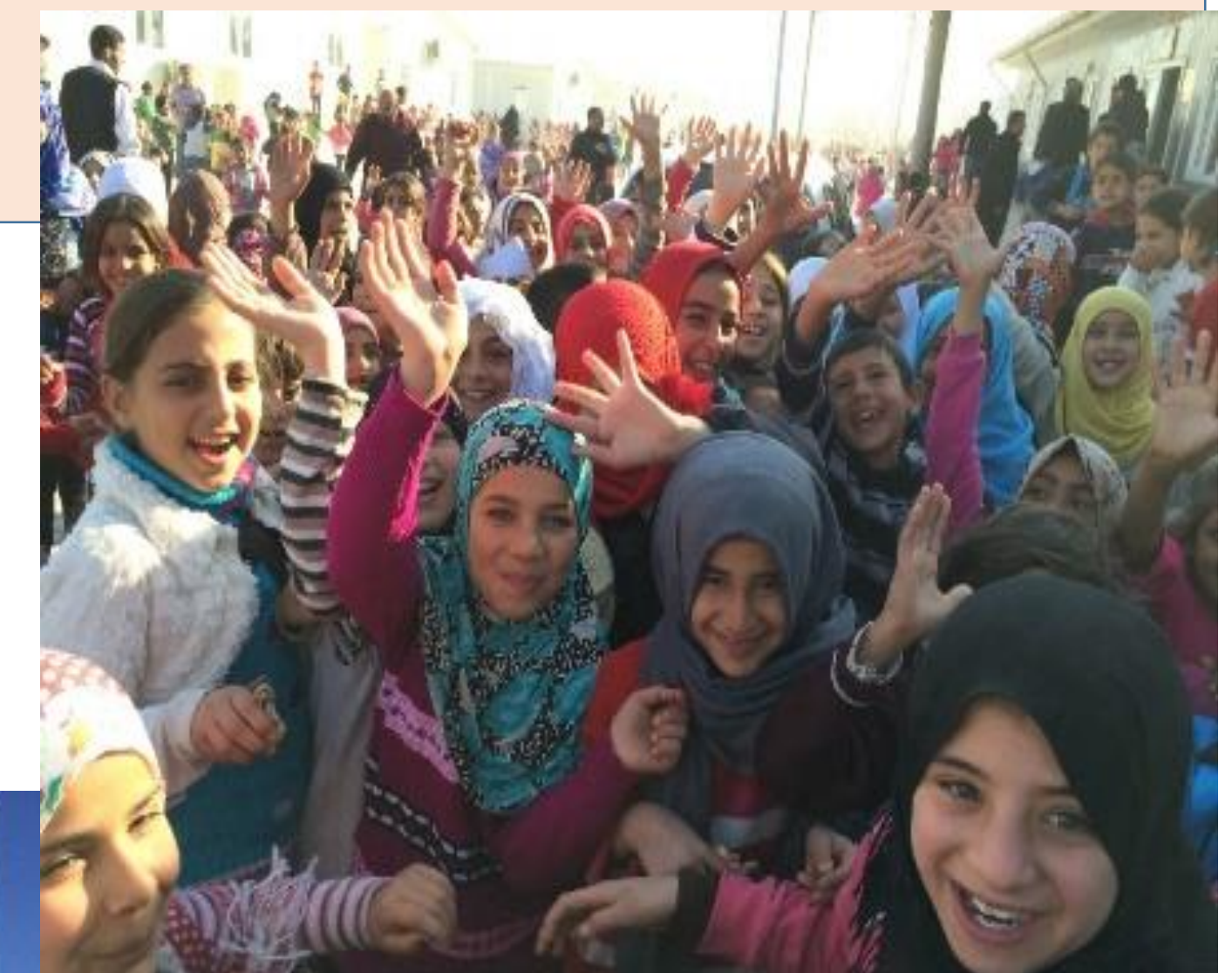
Total number of Syrians in the Protection Centers in Şanlıurfa 112.473