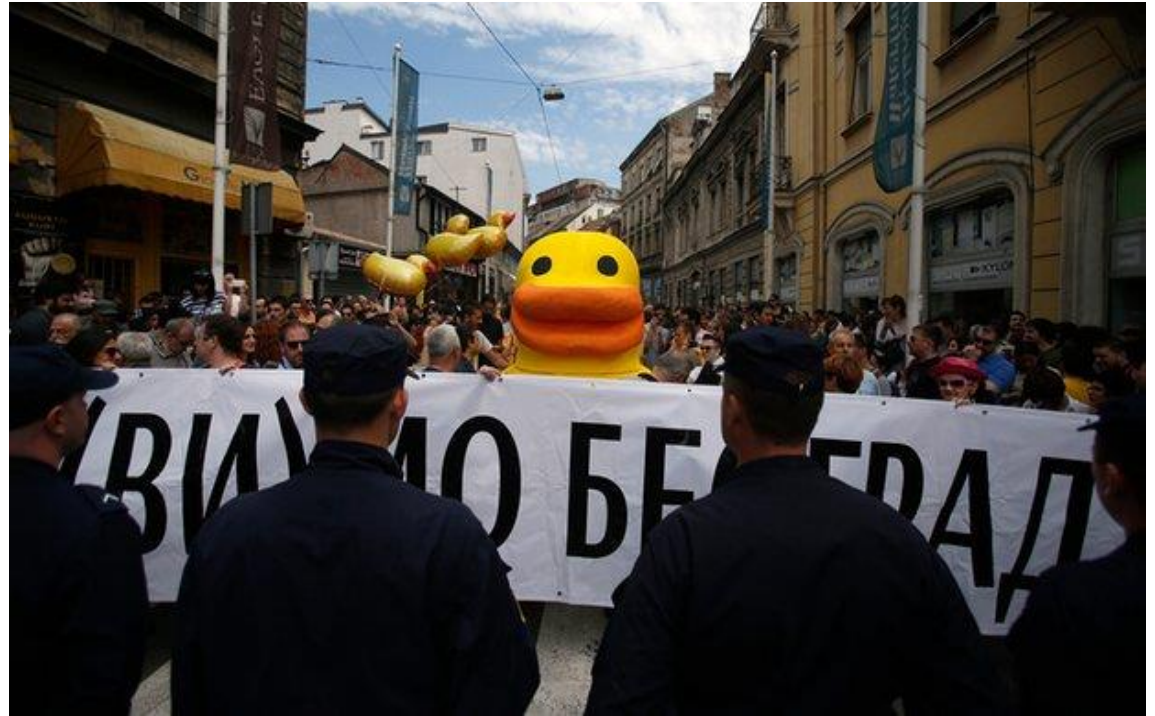
Illustration: Protests in Belgrade opposing the Belgrade Waterfront project in April 2016

The case, however, is not isolated. Hungary's nuclear deal with Russia, or the controversy surrounding Poland's Constitutional Court all show the same symptoms of democracy deficit.