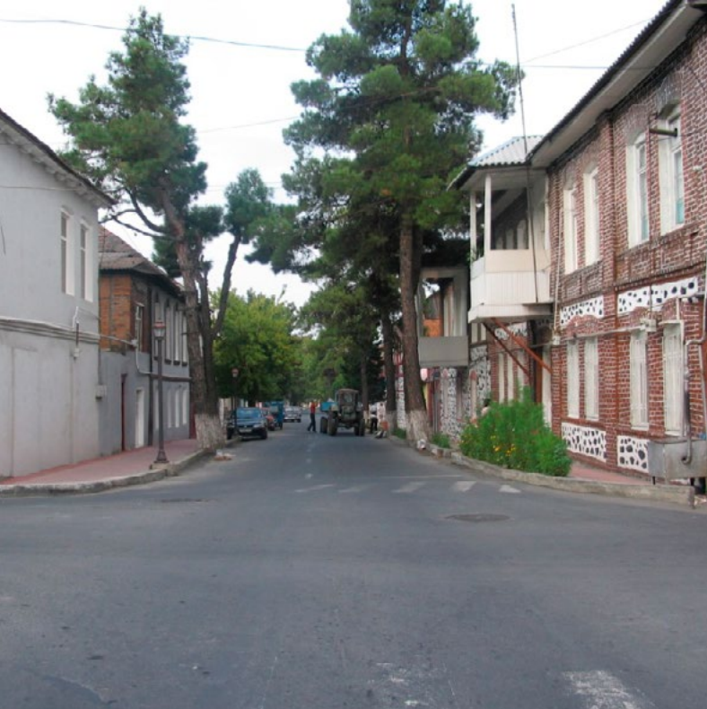
AZERBAIJAN ► ZAGATALA