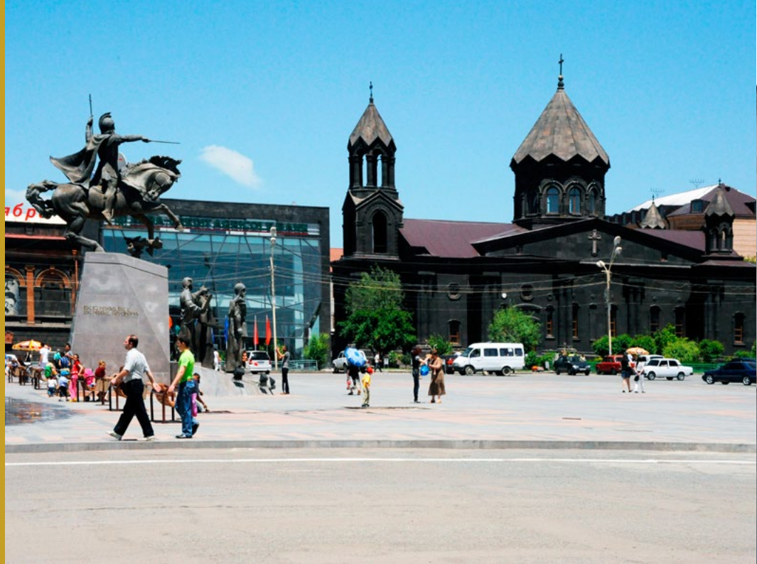
ARMENIA ► GYUMRI