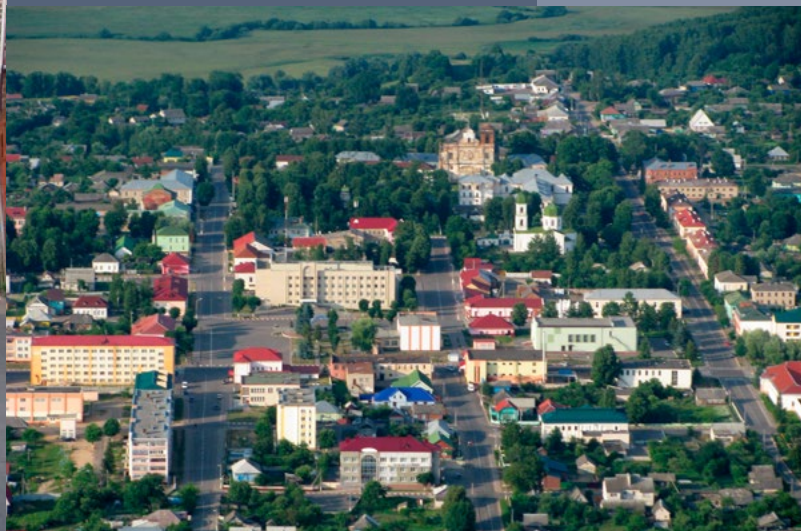
BELARUS ► MSTISLAVL