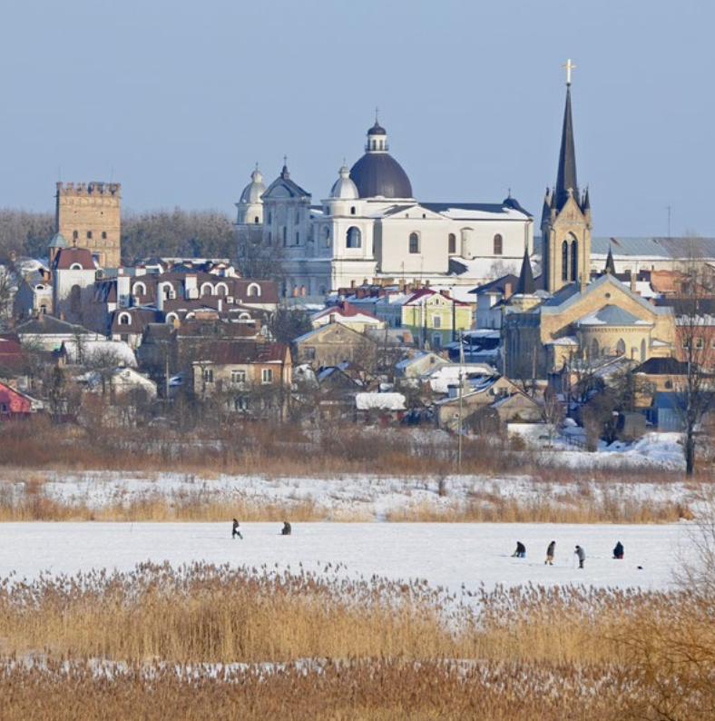
UKRAINE ► LUTSK