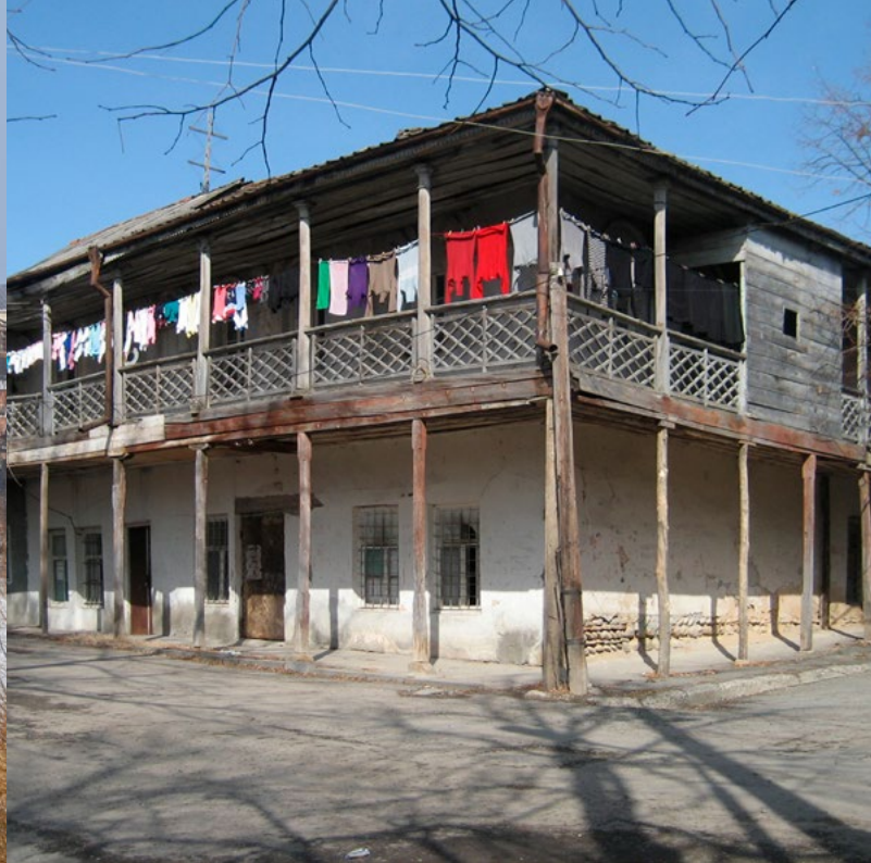
GEORGIA ► DUSHETI