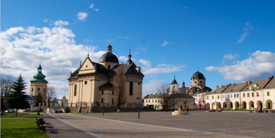
UKRAINE ► ZHOVKVA