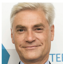
Bertrand de la Chapelle Internet & Jurisdiction Project