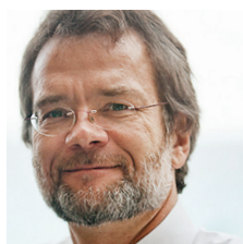
Alexander Seger Council of Europe