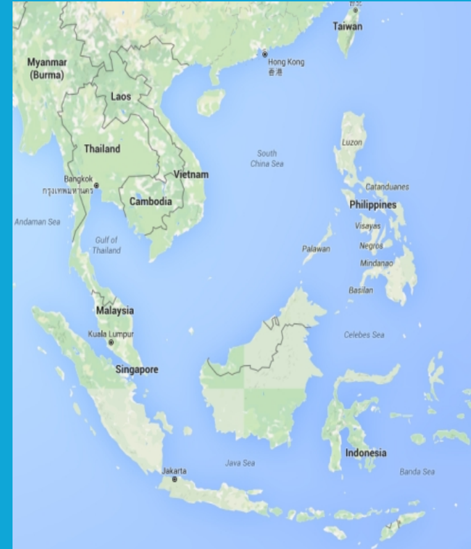
South East Asia