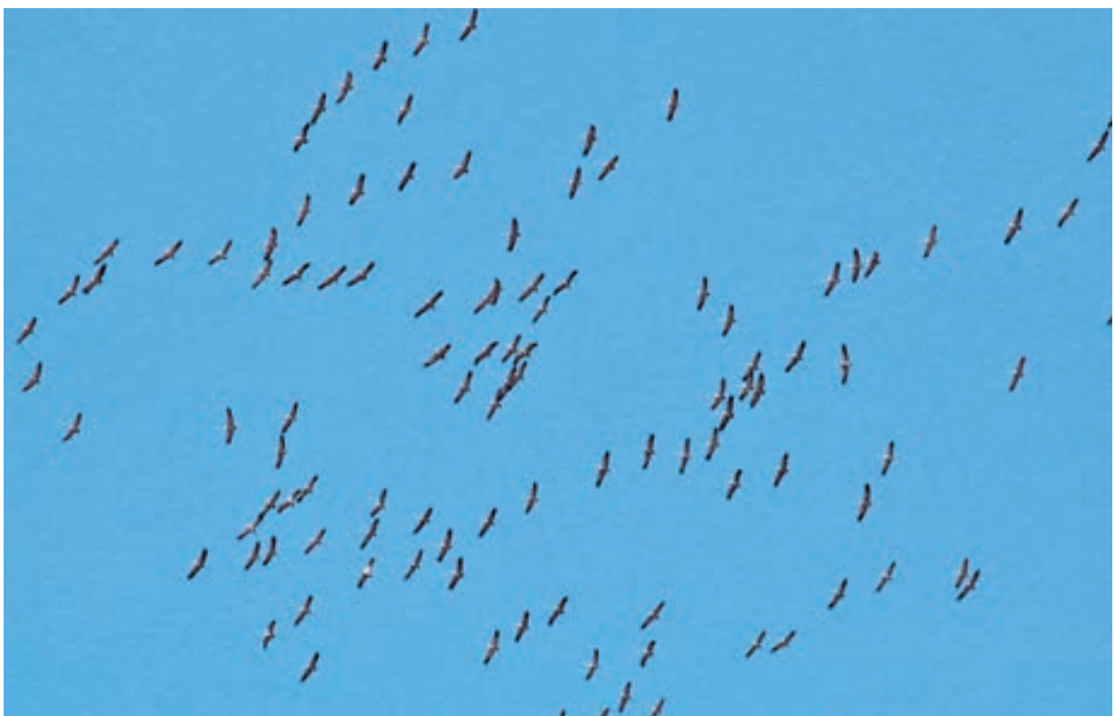
Common Cranes circle in order to find thermals for their flight across the sea.

A commendable new nature centre is now located on the road to Cape Greco as advertisement for the Natura 2000 bird protection area. The centre is directly beneath the bird migration bottleneck where, unlike wetlands reserves, the birds are observed from a tower—here the spectacle of migration takes place above the observers head.