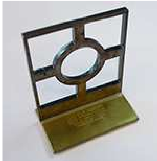
IFLA Europe 2014 ‘Landscape and Democracy’ Award granted to the Council of Europe

The 34 National Associations of the European Region of the International Federation of Landscape Architects - IFLA EUROPE, have granted the Silver Jubilee ‘Landscape and Democracy Award’ to the Council of Europe at their General Assembly held in Oslo, Norway, on 19 October 2014.