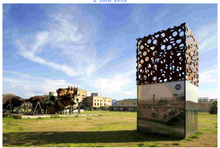
Carbonia, Sardinia, 4-5 June 2012 Study visit, 3 June 2012

Document prepared by the Landscape, Cultural Heritage and Spatial Planning Division Democratic Governance, Culture and Diversity Directorate – Council of Europe