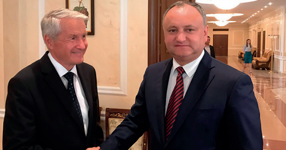
Secretary General Thorbjørn Jagland with President Igor Dodon during his official visit to launch the Council of Europe Action Plan for the Republic of Moldova 2017-2020 (30-31 May 2017).

■ The Office of the Directorate General of Programmes (ODGP) designs and co-ordinates Council of Europe co-operation activities in member states and in its neighbourhood. These activities are undertaken to help countries reach European standards in human rights, the rule of law and democracy.