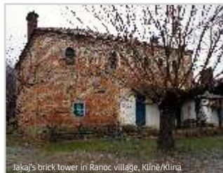
Jakaj's brick tower in Ranoc village, Klinë/Klina