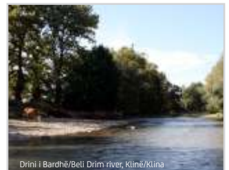
Drini i Bardhë/Beli Drim river, Klinë/Klina