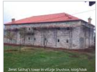
Zenel Salihaj's tower in village Shushice, Istog/Istok