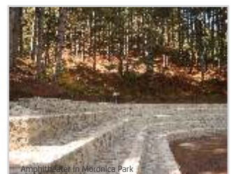
Amphitheater in Moronica Park