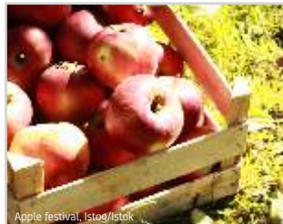
Apple festival, Istog/Istok