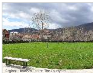
Regional Tourism Centre, The Courtyard