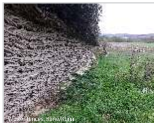
Wicker fences, Klinë/Klina