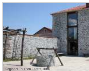
Regional Tourism Centre, Junik