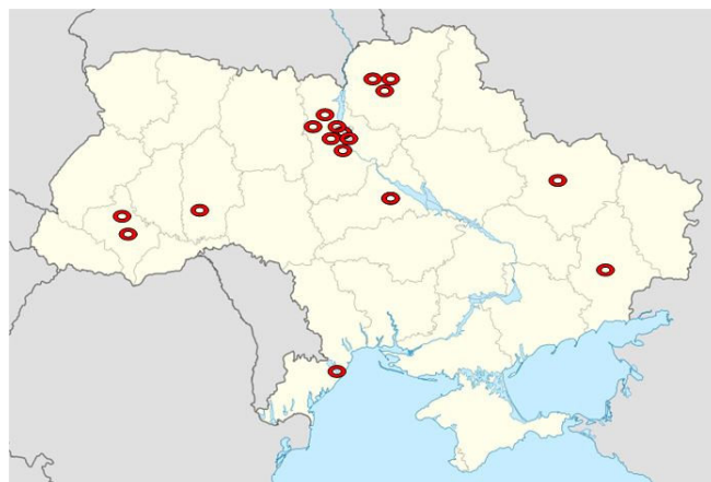
The Project's Geography Prison Management Component