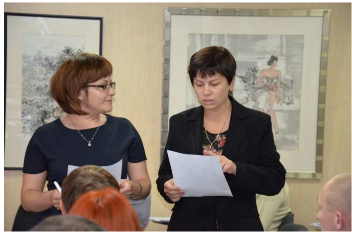
Seminar in Sevastopol (October 11–12, 2012)