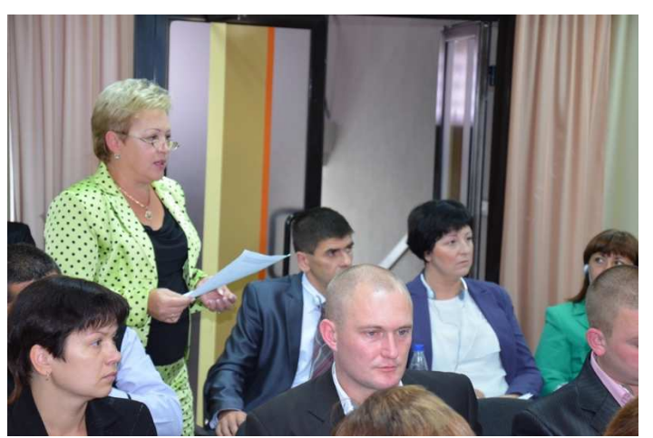
Seminar in Sevastopol (October 11–12, 2012)