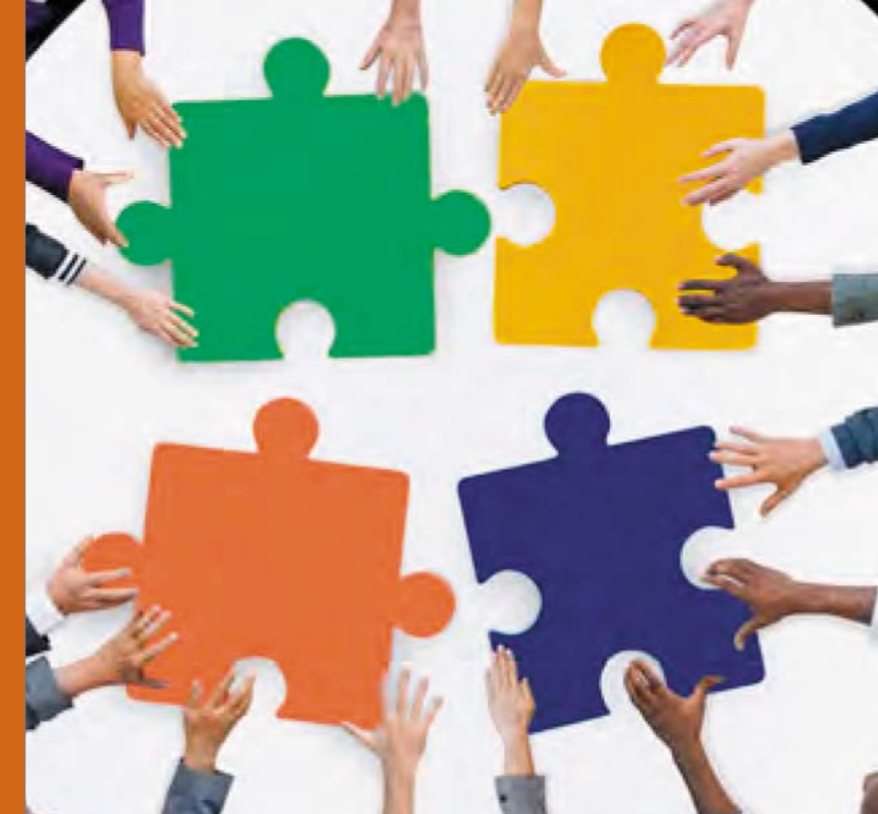
MAPPING THE OBSTACLES TO INTER-MUNICIPAL COOPERATION IN EASTERN PARTNERSHIP COUNTRIES