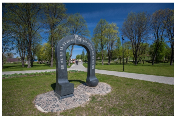
Utena Town Gardens. 2010.