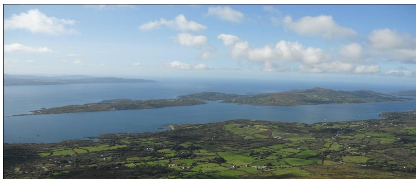
Figure 1: Aerial View of Bere Island, Co. Cork