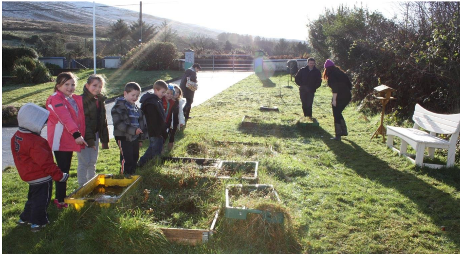
Figure 6: Green Schools Garden and Compost Bin