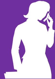
Media and Communications