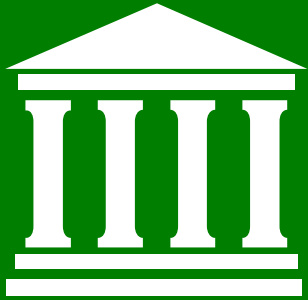
Policy and Governance