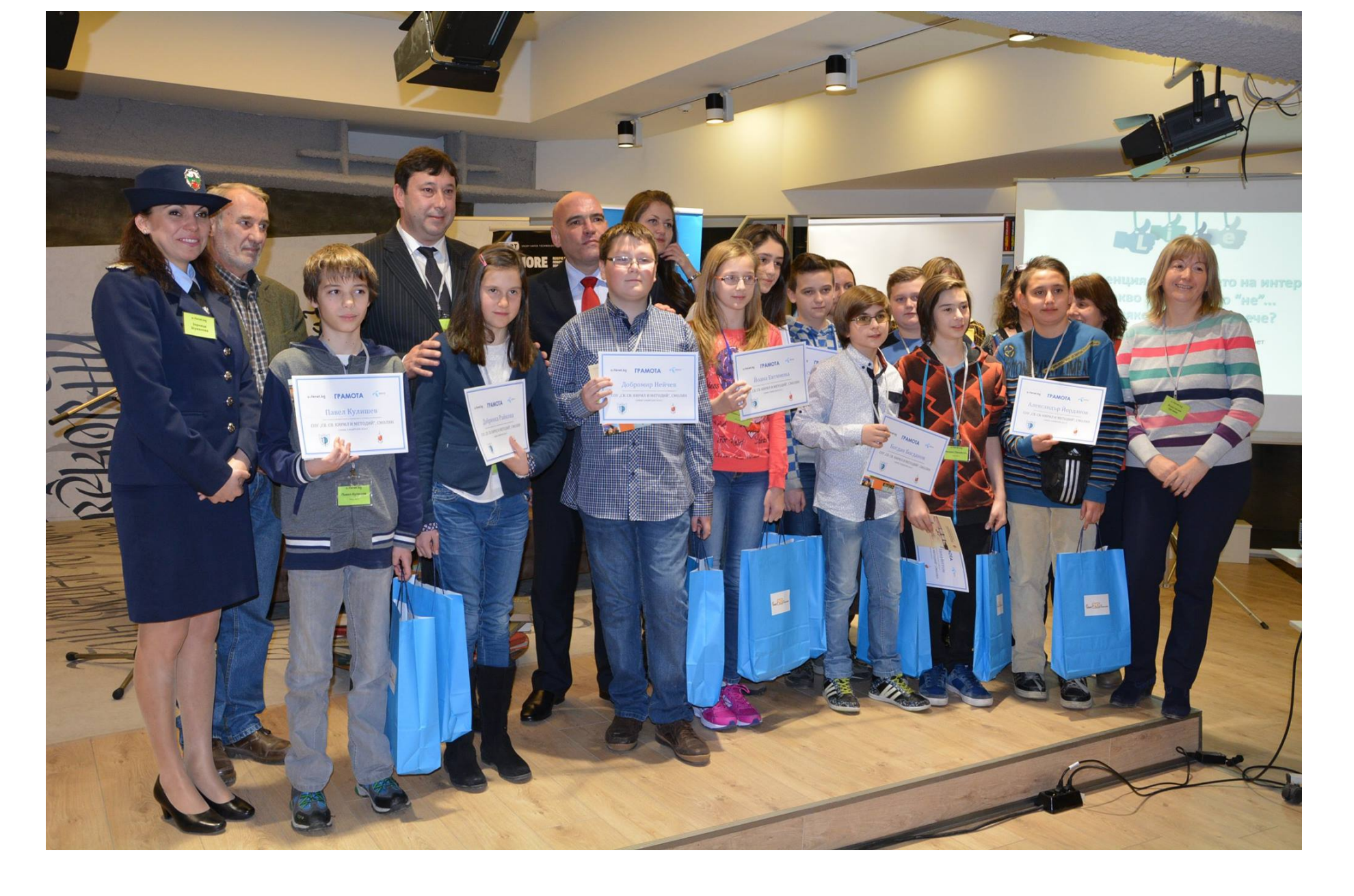
Award ceremony for the most active cyber scout teams