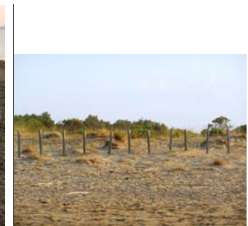
Photos 8, 9, 10: Vehicles on the sand dune zone and vehicle tracks on East Laganas beach. The majority of the wooden pillars on East Laganas have been destroyed or removed.