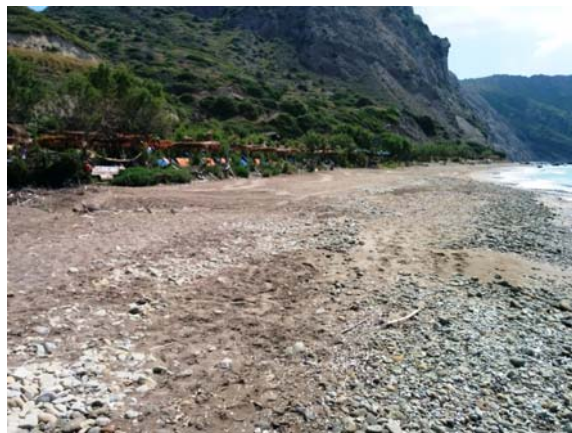
Photos 13, 14: Illegal constructions and beach furniture at the back of Daphni beach.