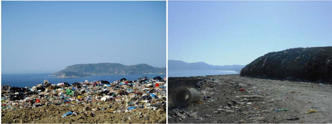
Photos 16, 17: The overfilled landfill site that exists within the boundaries of the NMPZ was still active during the 2015 nesting season.