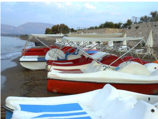
Photo 4: The eastern part of East Laganas was covered by pedalos and boats 24 hours a day.