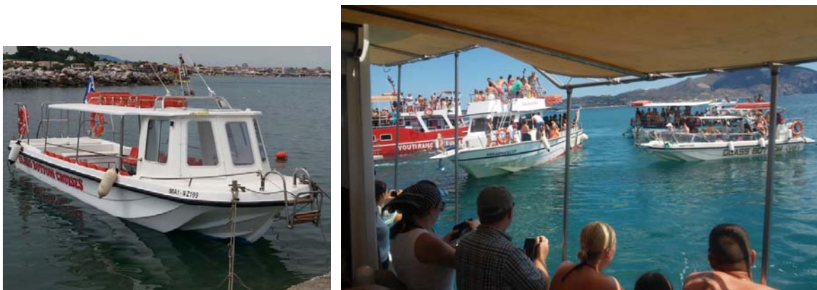
Photos 18, 19: Example of Turtle-Spotting Boat with a capacity of max 25 passengers (photo 18). In the majority of observations within the Turtle-Spotting Zone, boats larger than the recommended capacity of 25 passengers were present (photo 19).