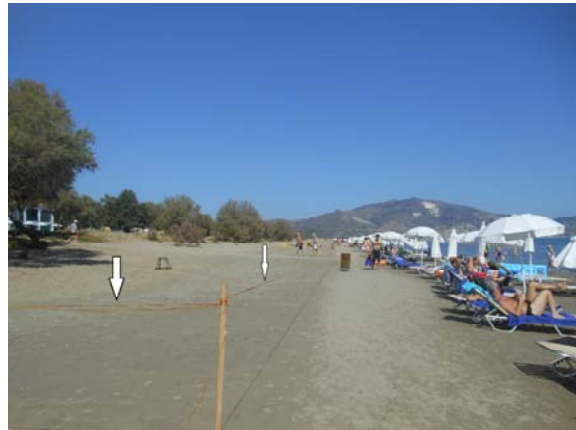
Photos 6, 7: The number of Marathonissi visitors (photo 6) is clearly unaffordable for the capacity of the beach. The rope in front of Zante Beach Hotel at the East Laganas beach (photo 7) was a successful measure for keeping beach users away from the nesting zone.