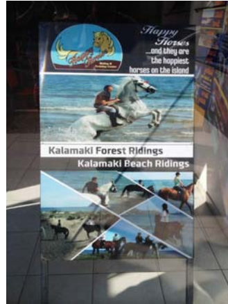
Photos 11, 12: Horse riding on East Laganas dunes and advertisement of local business providing beach horse-ridings.