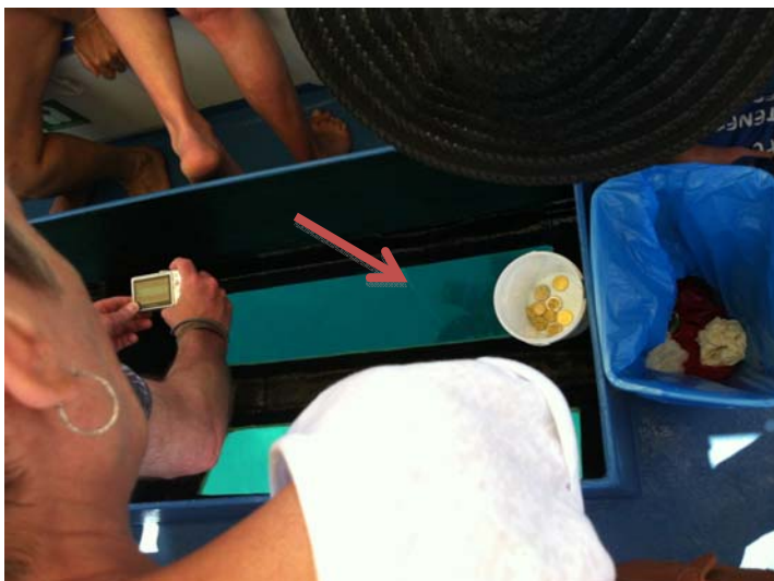
Photo 20: Non compliance with the Turtle-Spotting Code of Conduct. Glass-bottom boat passing over a observed turtle.