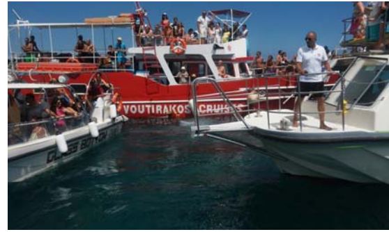
Photos 21, 22: Non compliance with the Turtle-Spotting Code of Conduct. More than two vessels observing simultaneously a turtle and violation of the minimum observation distance.