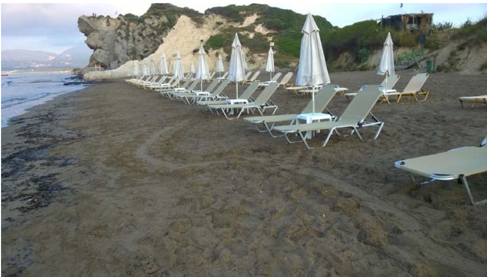
Photo 3: Kalamaki beach, 9 June 2015, 07:08 am: 44 sunbeds were left out overnight, a turtle track was found during Morning Survey hitting the sunbeds and going back to the sea without nesting, as the access to the nesting zone at the back of the beach was blocked by sunbeds.