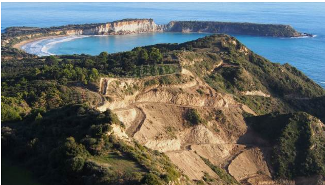
Photo 15: The recent illegal road construction in the area between Daphni and Gerakas.