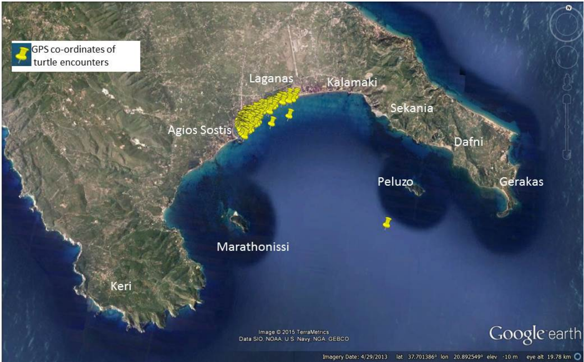
Illustration 4: Map of the Bay of Laganas, showing location of turtle encounters (result of monitoring work at the marine area during 2015).