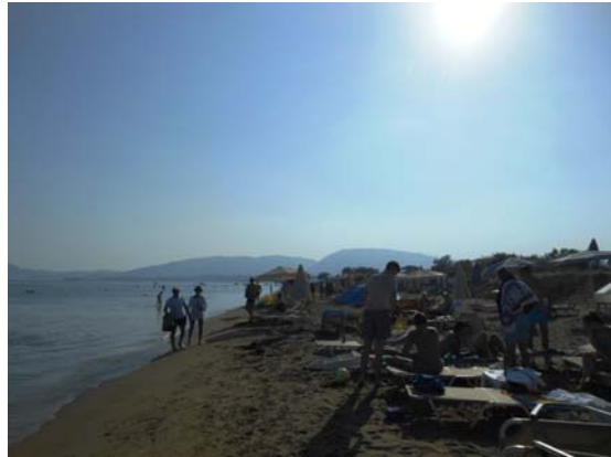
Photos 1, 2: During 2015 the recorded number of umbrellas in Gerakas (photo 1) was over 90 although the maximum number foreseen by the PD is 60. In East Laganas (photo 2) the umbrellas' density and maximum distance form the water-front were not implemented.