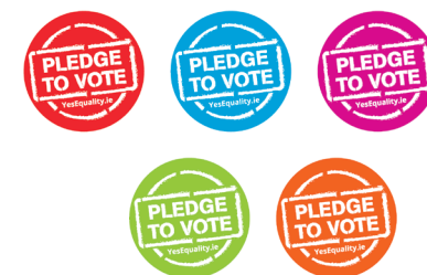
Stickers x5 colours