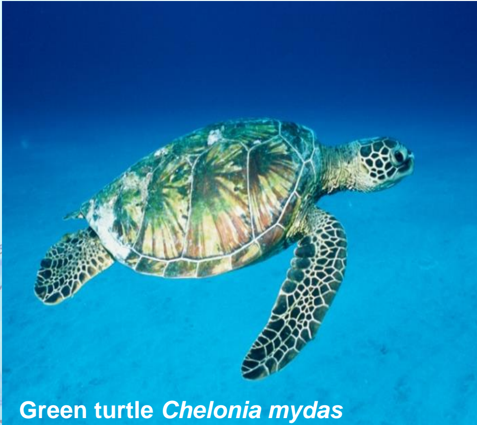
Green turtle Chelonia mydas