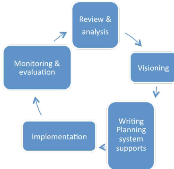
Figure 1: Phases of curriculum development and review

Prior to the initiation of a curriculum development or review process, educational authorities will have agreed that there is a need to reform EDC/HRE curriculum policy. The rationale for such an effort can vary. It may be that EDC/HRE syllabi and textbooks are reviewed as part of a normal cycle organised by educational authorities. There may be “triggering events” such as low-quality performances of students in comparative citizenship education studies, such as the International Association for the Evaluation of Educational Achievement (IEA) or International Civic and Citizenship Education Study (ICCS), 10 or other studies that show a low level of civic knowledge, attitudes and behaviours. It can also be that events external to the education sector, such as socio-economic contexts, new political leadership or a cross-sector action plan on children and young people, may warrant revisiting not only the EDC/HRE-related syllabi, but their broader framework and aims. Other local factors that will