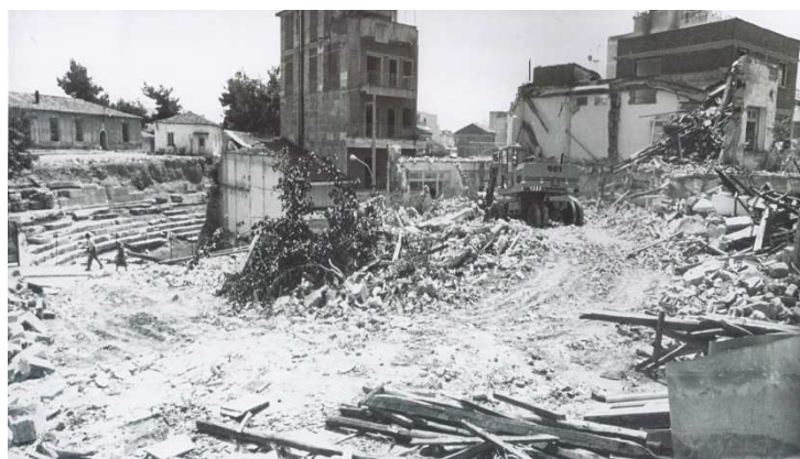
Photo from the beginning of the Ancient Theater excavation in the 80's

The two major central city squares (more than 13.000 m 2 each) are 150 meters apart and another 150 meters from excavation site of the Ancient Theater. They are characterized by a comprehensive urban landscape intervention, which enables the city of Larissa to welcome the revealed Ancient Theatre, by using a structured urban center, where various rhythms and qualities have the possibility to develop, "in the river's flow", through total design interventions, in a large-scale, a spatial natural and historical landscape.