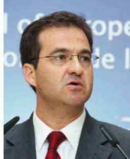
Luis Jimena Quesada, President, European Committee of Social Rights

In the current context of global economic crisis, the message that the protection of social rights must not be watered down needs to be as sincere as that concerning the indivisibility of all human rights. Economic and social policy debate should focus on mobilising and optimising available resources in order to pursue this goal of effectively implementing social rights. Consequently, joint financial strategies must not be devised in such a way that they are incompatible with legal solutions conducive to upward social harmonisation at European level. The ratification of the revised Charter by Austria in 2011 (and more recently, in January 2012, by "the former Yugoslav Republic of Macedonia") and the acceptance of additional provisions by Cyprus on the occasion of the Charter's 50th anniversary show an increased sense of responsibility at a time of economic crisis, which reinforces the view of the Charter as a means of facing up to the economic crisis through increased social commitment.