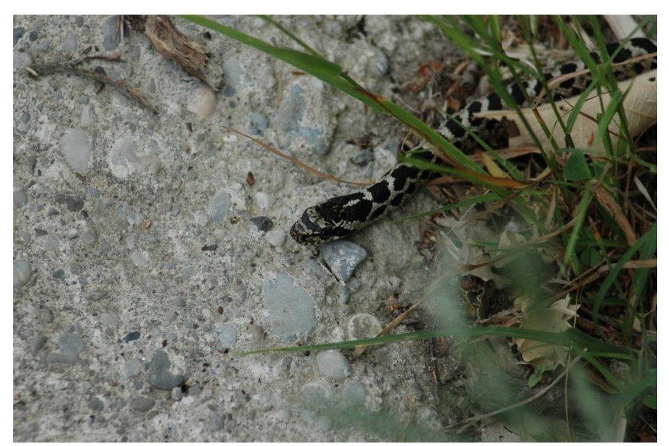
Elaphe quatuorlineata Adult