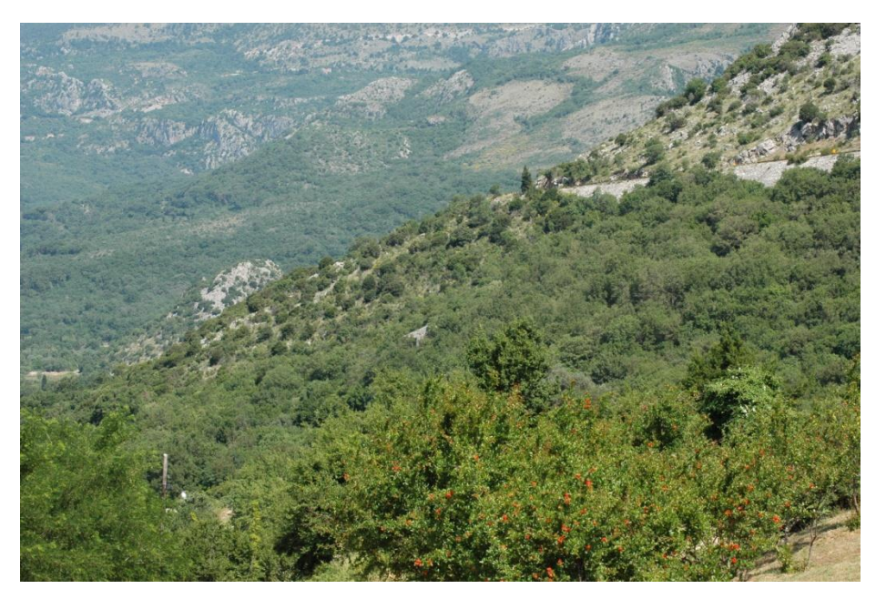
Nr. Durovici Buljarica fields and marshland Adriatic highway