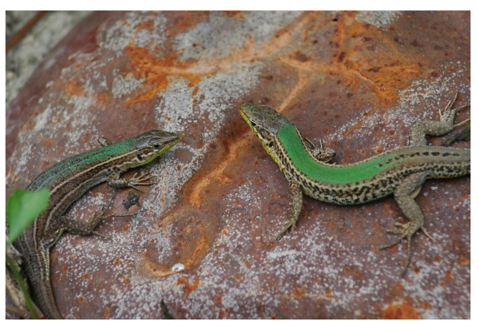
Algyroides nigropunctatus male