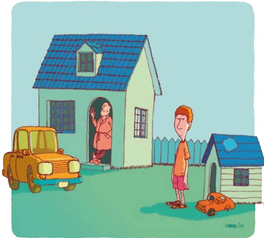
Children are not mini-human beings with mini-human rights.

Just as the Council of Europe systematically campaigned to rid Europe of the death penalty, it is now pursuing its vision of a continent free of corporal punishment. Hitting people is wrong – and children are people too.