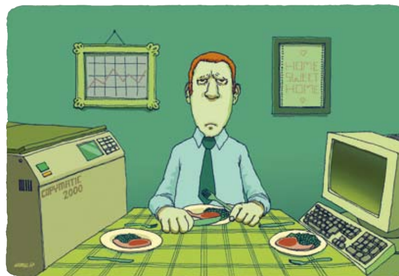
Positive parenting also means balancing family and professional life.