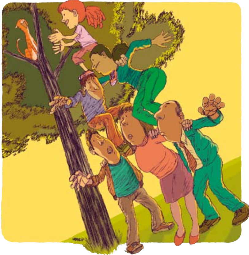
Children's rights make Europe grow.