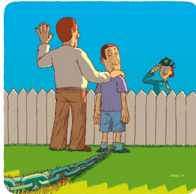
Human rights do not stop at the front door of your home.

The aim of this handbook is to brief parliamentarians and those who work with and for them on the legal and other measures needed to achieve the prohibition and elimination of all corporal punishment of children.