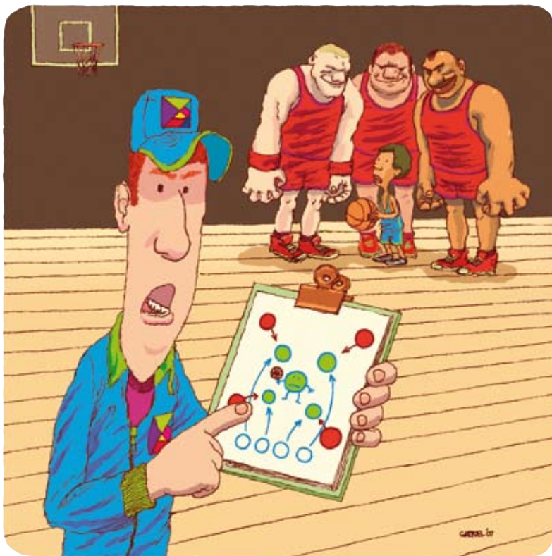
Protecting children calls for a strategic approach.

Global Initiative to End All Corporal Punishment of Children: < http://www.endcorporalpunishment.org >. Detailed information on all aspects of prohibiting corporal punishment is available on this website.