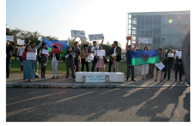
Participants organising a protest in front of the European Parliament asking for a reaction to hate crimes against Roma people

In the past the main focus of the debate was human rights in general. The disrespect and violation of fundamental rights of the Roma was a matter of concern at that time. The focus was not so much on what was going on in particular policy fields, rather more on human rights violations as a result of police brutality, mob attacks by members of the non-Roma majority and Nazi-oriented extreme nationalistic groups. Of course, times have changed in Europe, and the Roma rights issue has been well articulated and put on the political agenda of intergovernmental institutions such as the Council of Europe, the European Union and the OSCE. This has created a reasonable recognition of Roma issues and attracted the attention of different stakeholders and experts. Unfortunately, this does not apply so much to national governments.