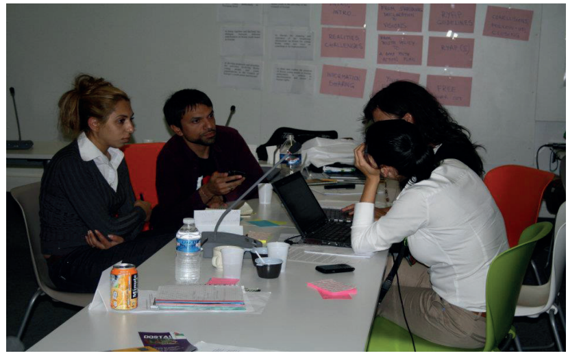
Participants in working groups during the Conference

Policy priorities for the Roma Youth Action Plan should be key issues, selected in a way to ensure leverage on a whole range of related issues. Each of these priority themes should be approached in a comprehensive way, as regards the stakeholders, key actors, beneficiaries and expected impact. The involvement of multiple actors is crucial, ensuring that all those persons and institutions affecting Roma youth socialisation are targeted in a comprehensive policy reform.