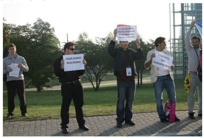
Participants organising a protest in front of the European Parliament asking for a reaction to hate crimes against Roma people

The seminar Violence Against Young Women In Europe, held at the European Youth Centre Budapest from 21 to 27 May 2001 within the framework of the Human Rights Education Youth Programme, targeted young Romani women as a highly vulnerable group. The seminar aimed to share experiences and approaches in dealing with violence against young women across Europe, identify educational and social strategies to address the issue at European level, and highlight the need to combat these persisting violations of human dignity through legal and educational means.