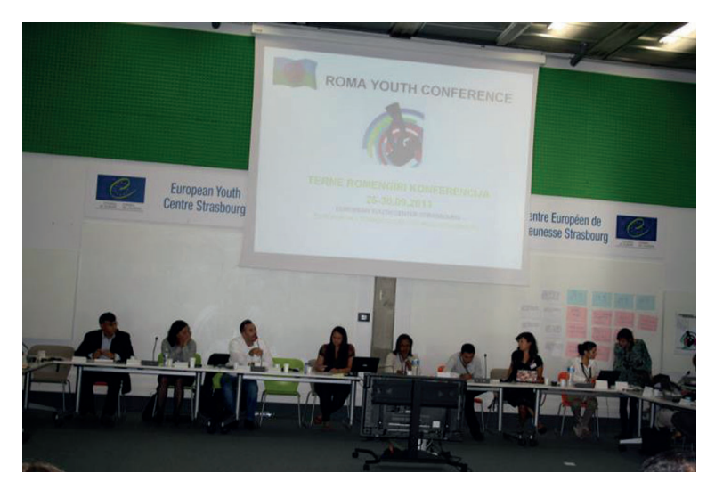
Participants at the Opening of the Conference

A number of young people also noted that they would like to improve their knowledge on youth policies and the activities of the Council of Europe and other international organisations. Several people expressed their wish to learn in detail about the Strasbourg Declaration and "define how Roma youth could contribute to its implementation."