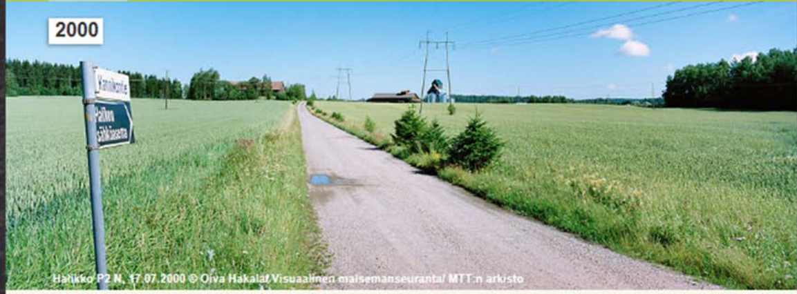
Halkko P2 N. 17.07.2000