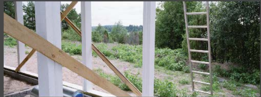
Hietikko, Viljakkala A2 05.07.2007