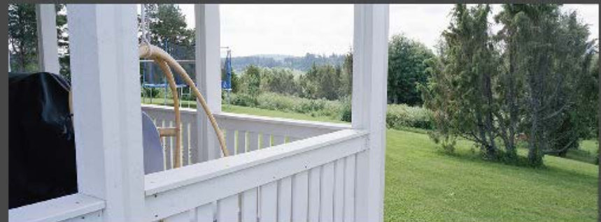
Hietikko, Viljakkala A2 03.07.2012