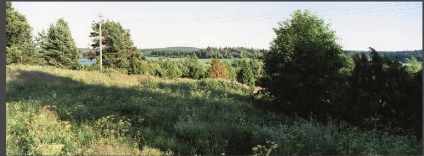
Hietikko, Viljakkala A2 05.07.2001