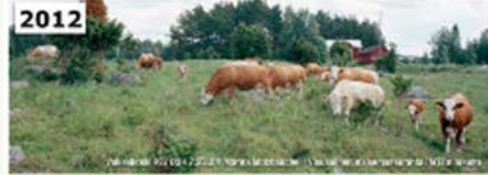
An example of changes in rural landscapes in the 21st century.