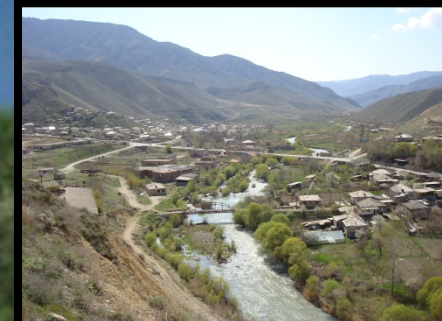
Highland Lake Sevan, 1900 m (Gegharqunik Marz/Region, RA)