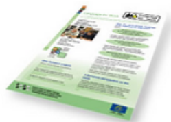
Information flyer for the wider public in English French Spanish