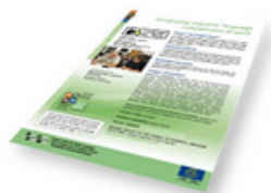
Project flyer in English and French

Join the network to access the Community section . Network membership is free.