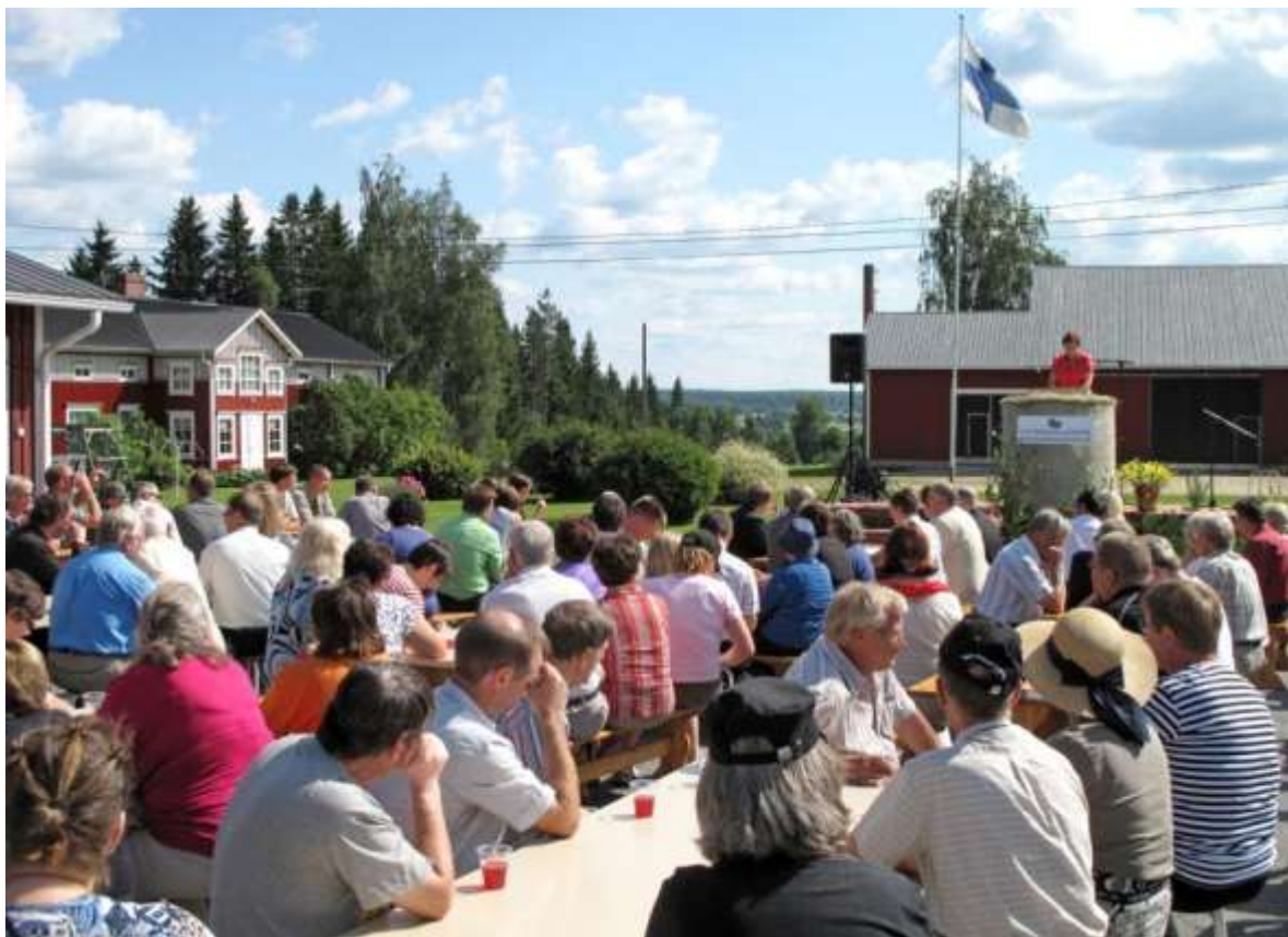
Photo 4. Villagers and representatives of authorities celebrating the establishment of the Hyypä Valley Landscape Conservation Area.