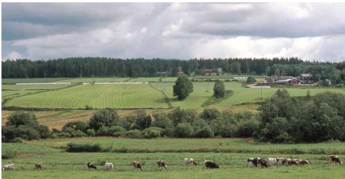
Photo 1. Typical scenery in the Hyyppä Valley Landscape Conservation Area. Agriculture is an important livelihood in Hyyppä river valley.