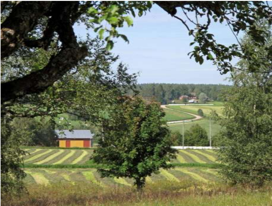
Photo 10. Forests alternate with wide-open field landscapes in the Hyypä Valley.