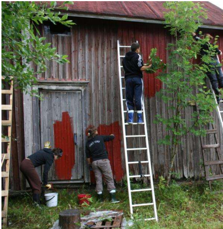
Photo 6. Young volunteers of international work camp painted the walls of an old co-op store using traditional red ochre paint made by a local Hyyppä Valley entrepreneur.