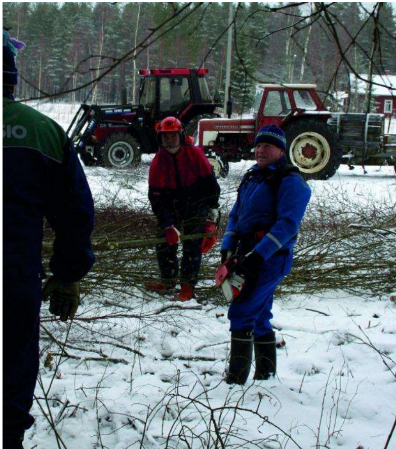
Photo 7. Volunteers opening up views from the main road over the Kauhajärvi village church. Villagers have been eager to contribute to preserving the landscape.