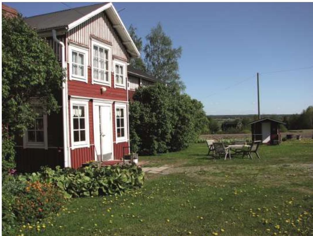
Photo 8. Traditional Ostrobothnian house in the Hyyppä Valley.