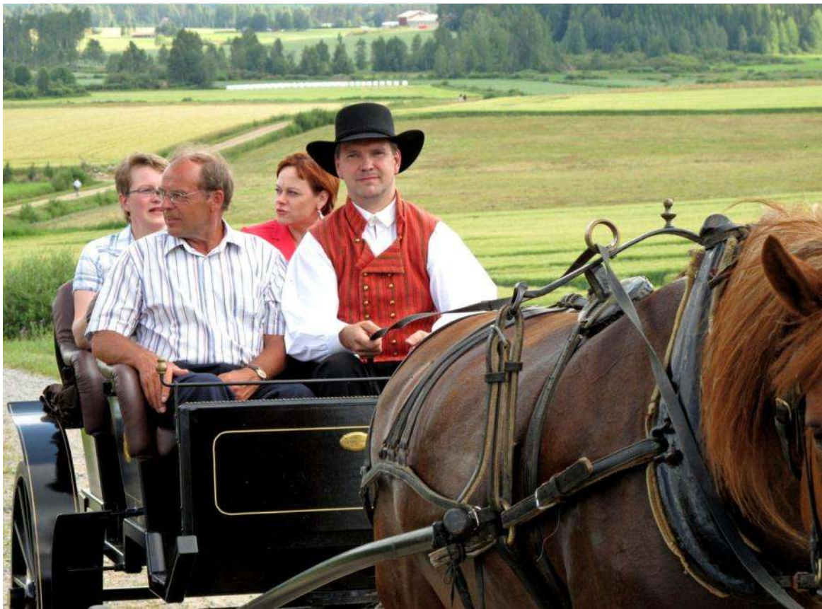
Photo 3. After the celebration of the establishment of the Hyypä Valley Landscape Conservation Area Minister of the Environment, Paula Lehtomäki (back row, on the right), was taken for a horse cart ride.