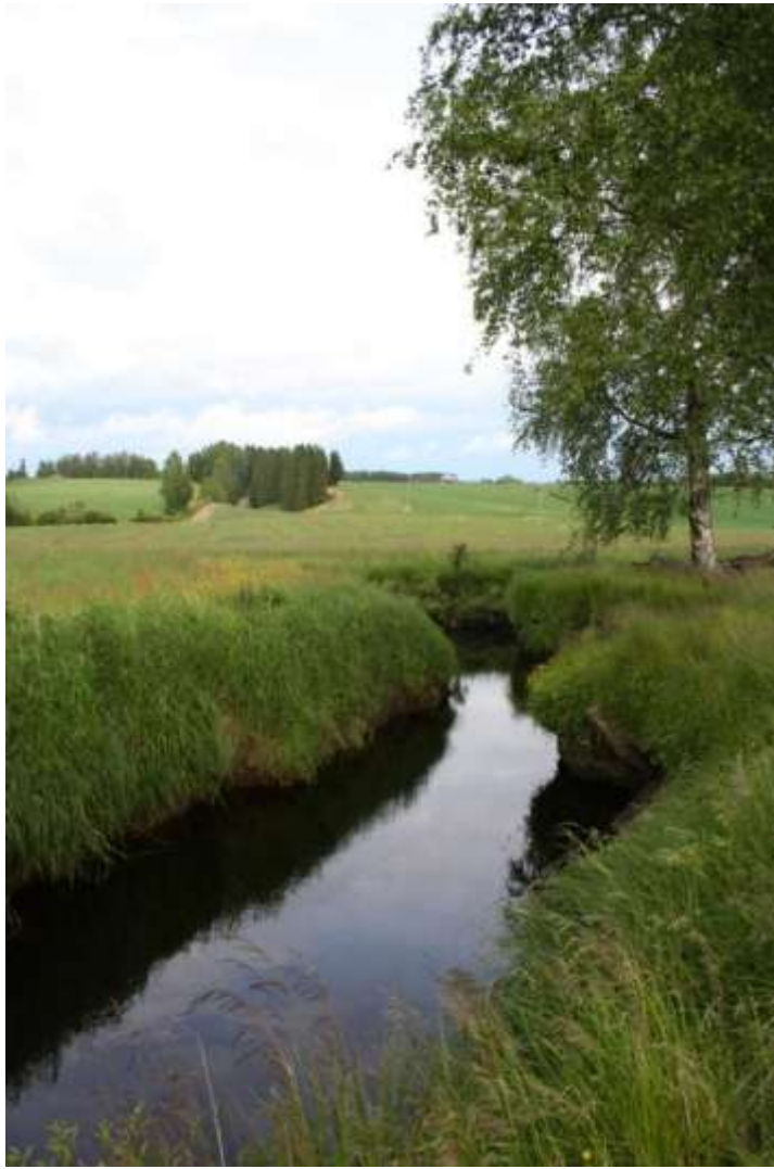
Photo 9. The Hyypä river is narrow and meandering.