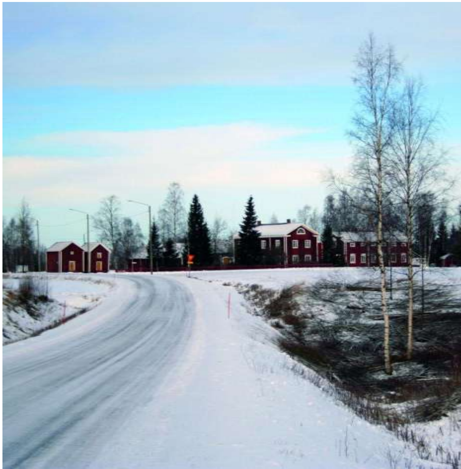
Photo 5. Nationally valuable Hämes-Havunen country house, with its traditional closed yard. The estate was renovated in 1981 by the City of Kauhajoki, for use as festive facilities.