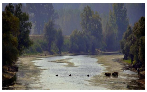
Figure 1: The settlement of Ivanovo and the view at the Dunavac (Ivošević M., Petrović, A., Glavinić I. Ignjatijević, M., 2013)