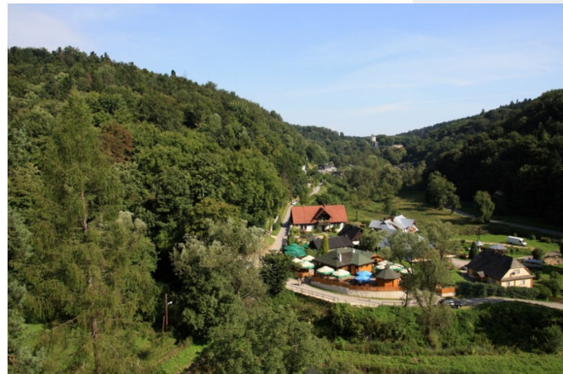
13th Council of Europe Meeting of the Workshops for the implementation of the European Landscape Convention