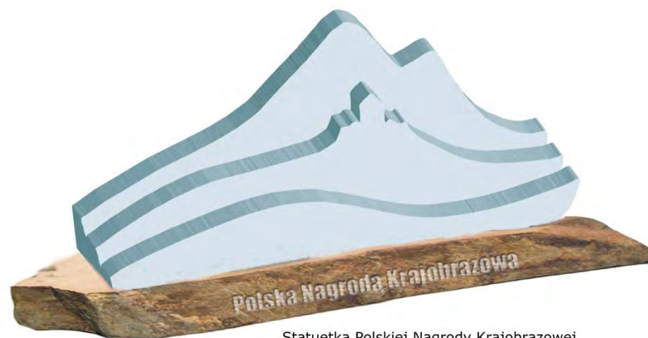
Statuetka Polskiej Nagrody Krajobrazowej - projekt i wizualizacja oparte o logo Europejskiej Konwencji Krajobrazowej