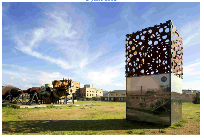
Carbonia, Sardinia, 4-5 June 2012 Study visit, 3 June 2012

Document prepared by the Landscape, Cultural Heritage and Spatial Planning Division Democratic Governance, Culture and Diversity Directorate – Council of Europe