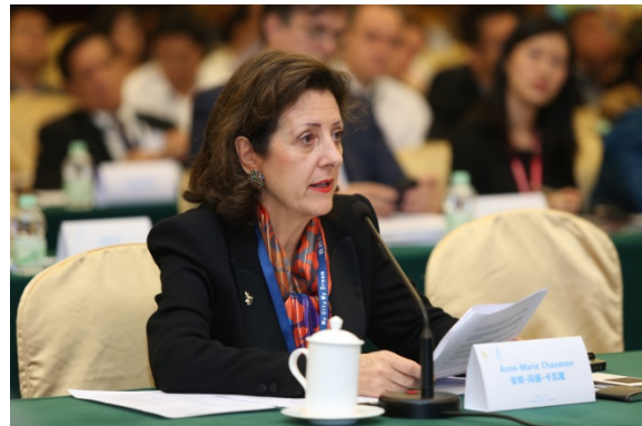
Guangzhou (China) International urban innovation Award – Climate and participation

Bureau de la commission élu le 26/06/2014