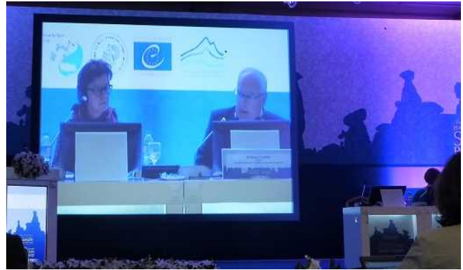
Urgup (Turquie) - European Landscape Convention – Landscape and sustainable economy