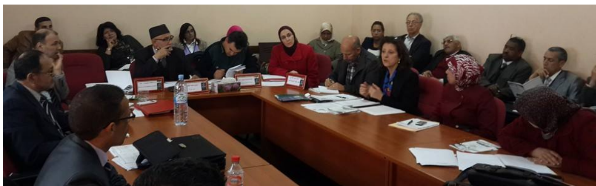
Rabat (Maroc): Clôture du Dialogue national sur la société civile /Closing ceremony and workshop