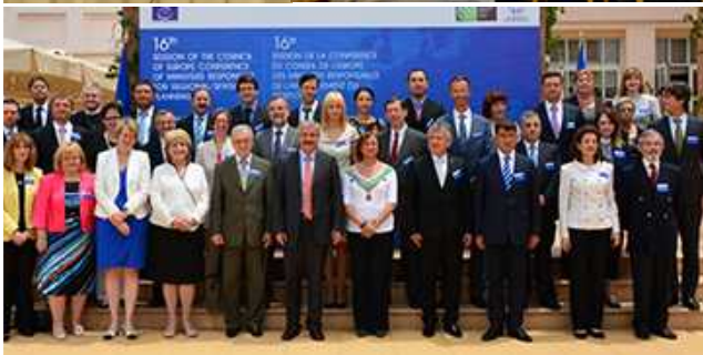
CEMAT – Athenes : démocratie territoriale / territorial democracy