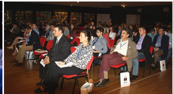
Roumanie : Forum national gouvernement/ONG : Organised civil society and participation