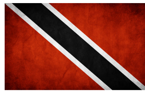
Trinidad & Tobago 2013