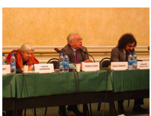
Participants at the Moscow round table

On 23 September 2008 ECRI held a national round table in Moscow. The main themes of this round table were: ECRI's Third Report on the Russian Federation; racism, xenophobia, anti-Semitism and intolerance in public discourse and in the public sphere; racist violence in the Russian Federation and the legislative and institutional framework for combating racism and racial discrimination.